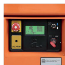
TOUCH DISPLAY SCREEN