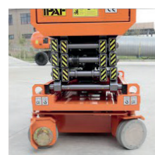
TIGHT TURNING RADIUS RAM STEERING