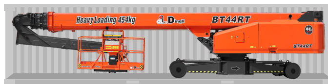
Standard Container Transport