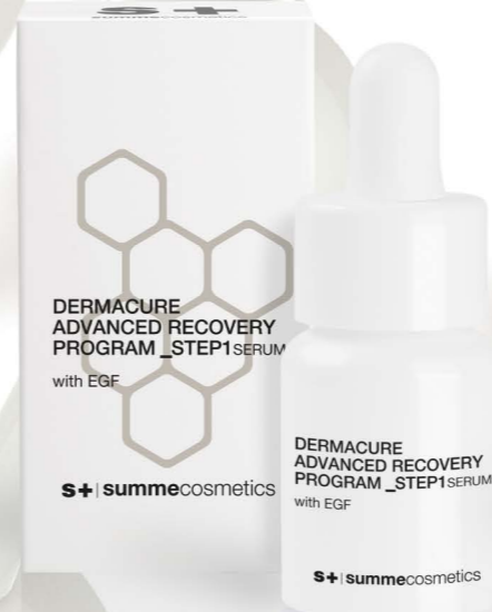
ACTIVADOR CELULAR REGENERATIVO. REGENERATIVE CELL ACTIVATOR.

Facial mask rich in intensely nourishing active ingredient that restore the strength and energy to the skin's structures. It provides an extraordinary sensation of comfort to the skin after the peeling process. Balances and moisturises in depth. It contributes towards recovering the epidermal texture.