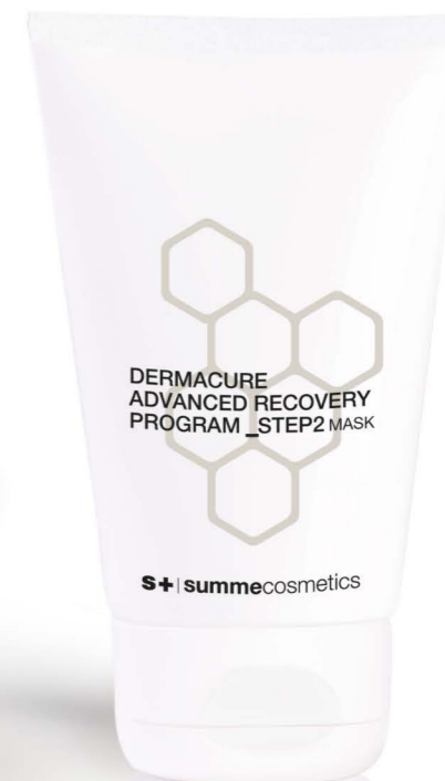
MASCARILLA RECONSTRUCTORA. RECONSTRUCTIVE MASK.