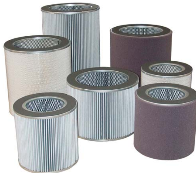
Compact & Large Elements with Metal Endcaps