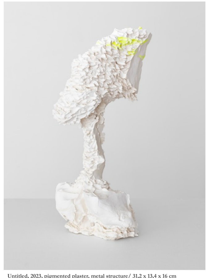
Untitled, 2023, pigmented plaster, metal structure/ 31,2 x 13,4 x 16 cm