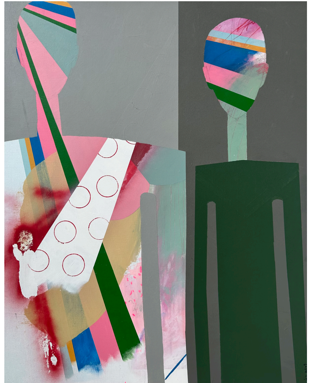
Jazz Mang, infrarot no. 7, 2022, Mixed media on canvas, 100 x 80 cm