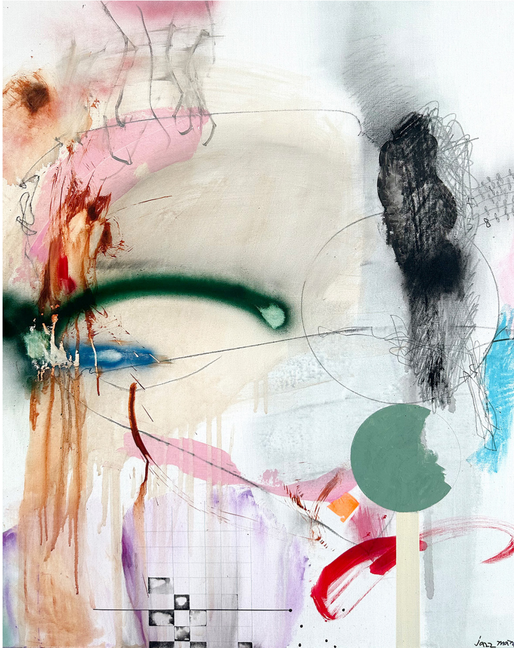
Jazz Mang, oxygen, 2023, Mixed media on canvas, 100 x 80 cm