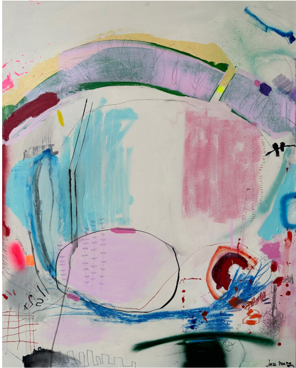
Jazz Mang, Untitled, Mixed media on canvas, 100 x 80