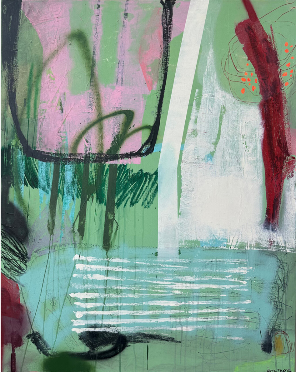
Jazz Mang, Untitled, Mixed media on canvas, 100 x 80