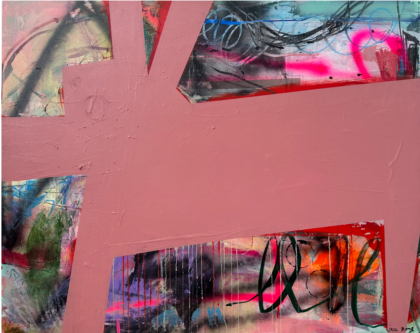
Jazz Mang, Untitled, 2022, Mixed media on canvas, 80 x 100 cm