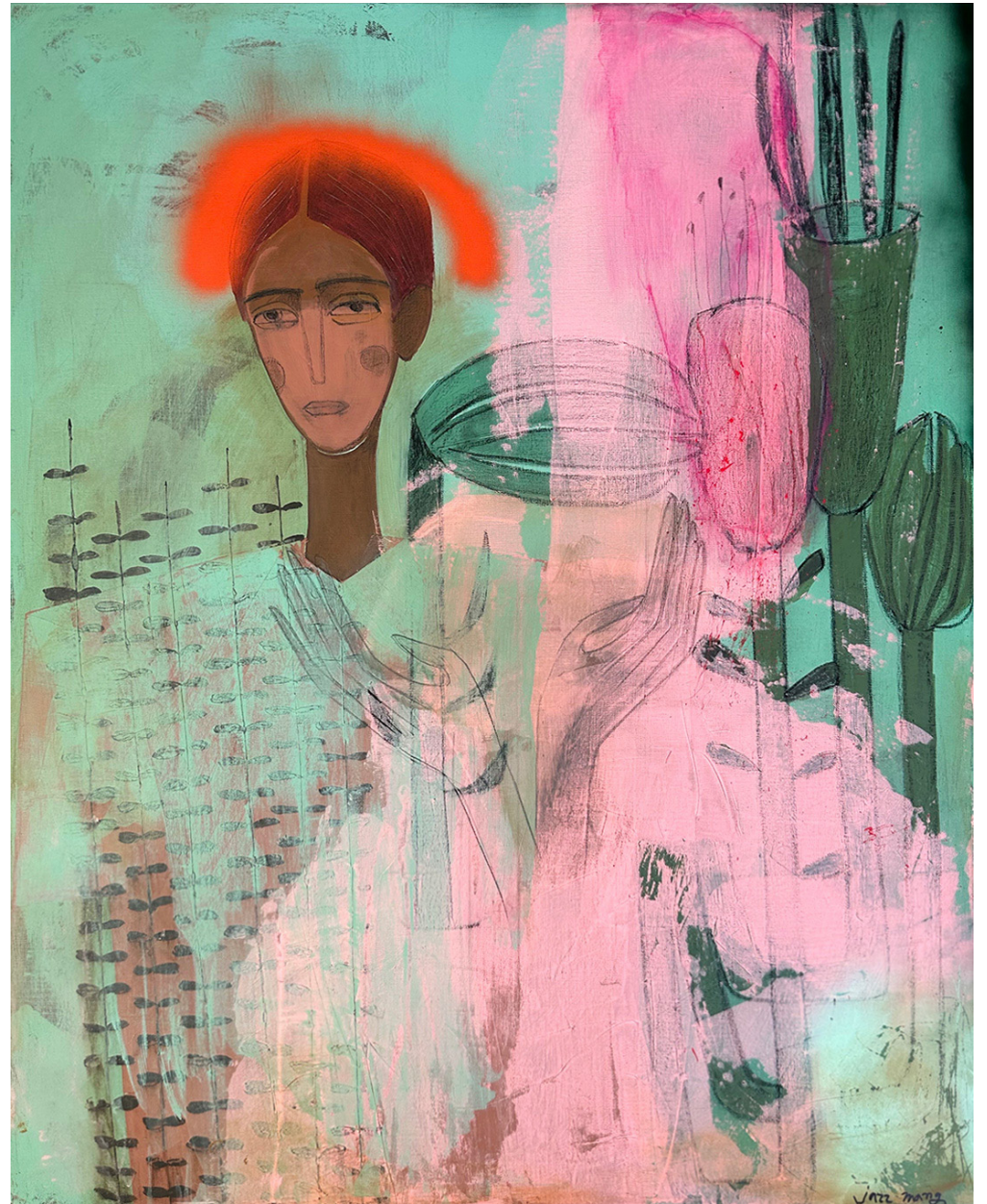
Jazz Mang, tilda, 2023, Mixed media on canvas, 100 x 80 cm