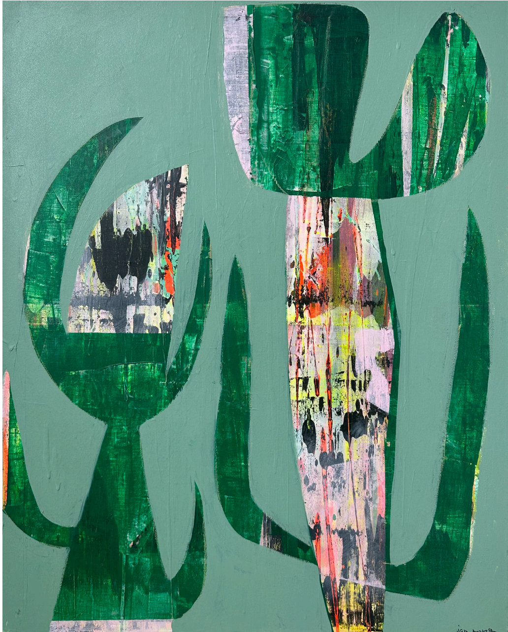
Jazz Mang, Untitled, 2022, Mixed media on canvas, 100 x 80 cm