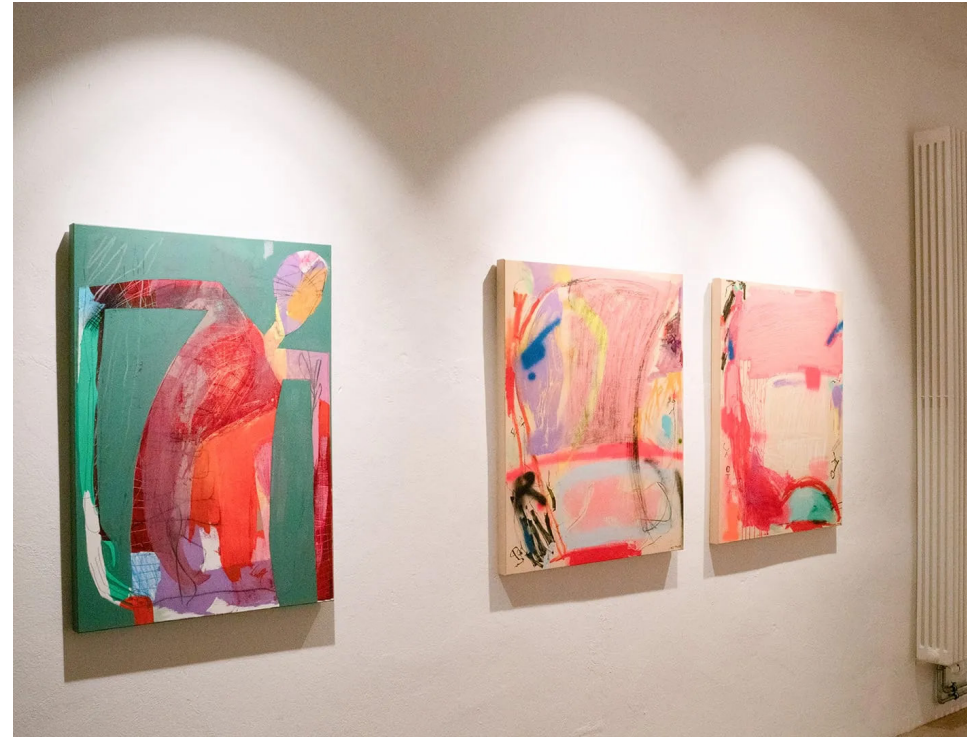
Jazz Mang, Installation view, Plasma, 2022, GE59 Art Work Space, Berlin