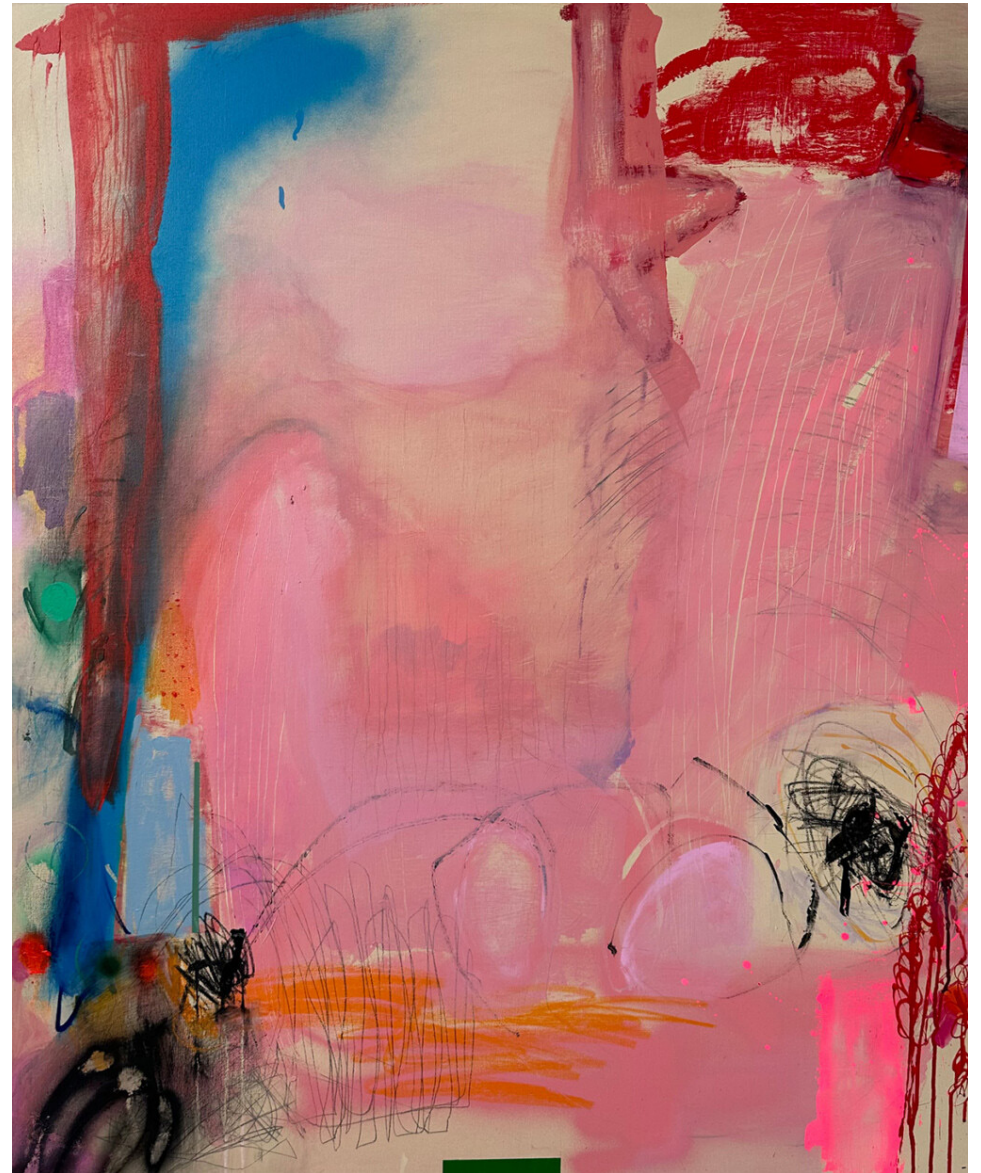
Jazz Mang, infrarot no. 8, Mixed media on canvas, 120 x 100