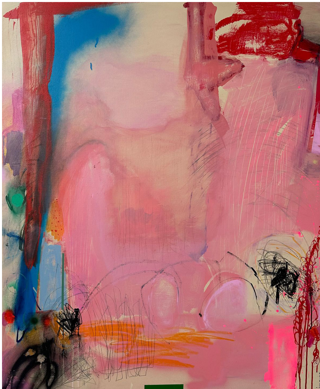
Jazz Mang, infrarot no. 8, 2022, Mixed media on canvas, 120 x 100 cm