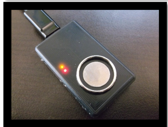
Figure 1: Top: iButton® Typer™ with an iButton on it. All three LEDs are on.

Bottom: The iButton® Typer™ without an iButton on it. The red and yellow LEDs are on.