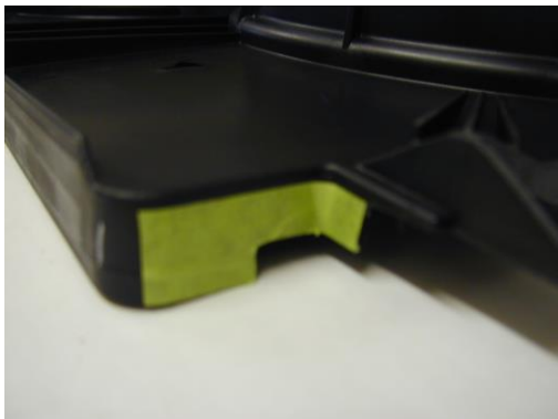
Top left corner

The above photo shows two areas that need to be removed to access the cooler ports. The upper hole is a half circle. Use a 1.5" hole saw just inside the shroud edge, approximately 2" below the top of the mounting tab. The lower rectangular section can be removed with a hacksaw.