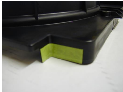
Top right corner

Both the upper corners of the shroud need to be trimmed as shown by the tape area.