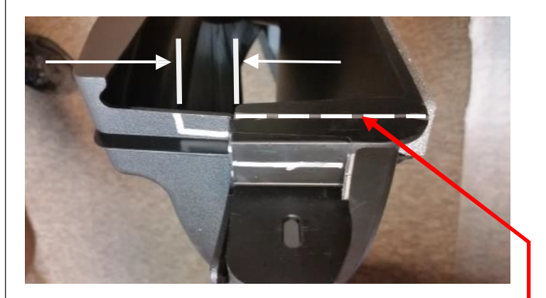
Cut 1/2" off from this point to opposite side.

Note: Only the bottom 2/3 of the hood duct is going to be cut back 1/2". Cut through front face 1/2"deep only.