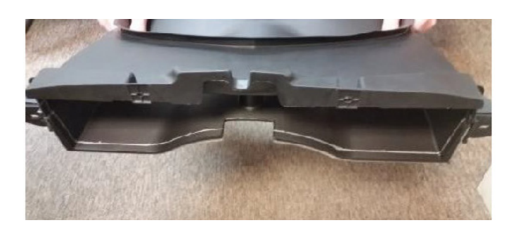
Finish cut along the bottom. You will cut through the foam seal on the bottom. Try to keep the remaining seal intact.