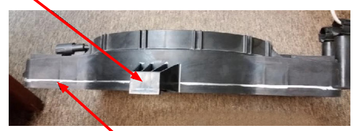
Cut back 1/2" all around the shroud. Leaving flanges on both left and right sides.