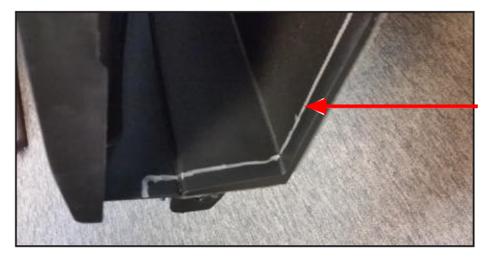
Sharpe offers a silver color marker that helps when working with dark items.