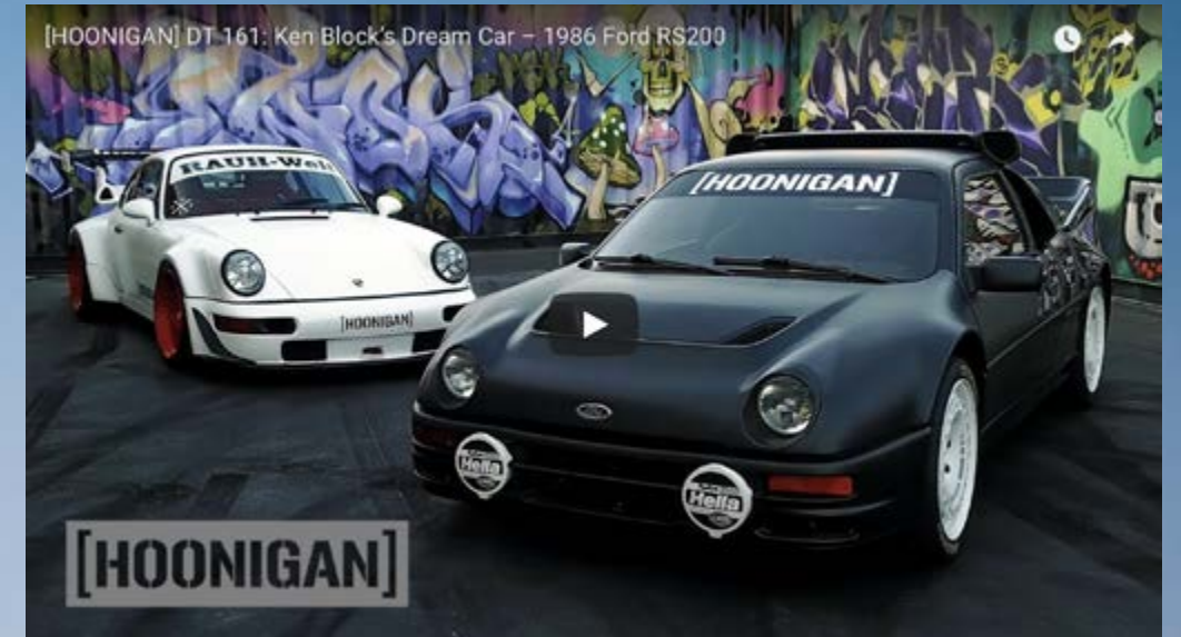
[HOONIGAN] DT 161: Ken Block's Dream Car - 1986 Ford RS200