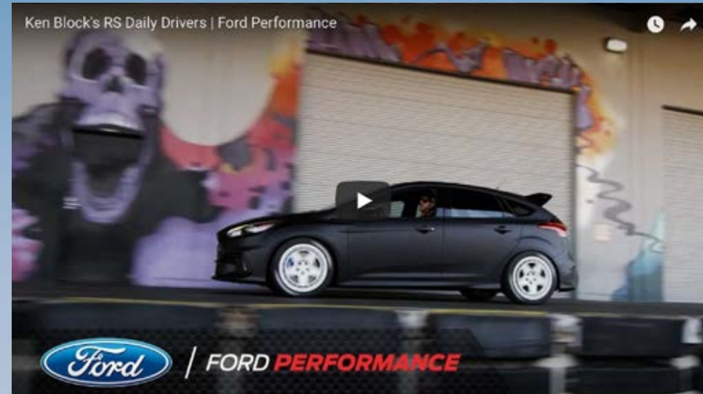
Ken Block's RS Daily Drivers | Ford Performance