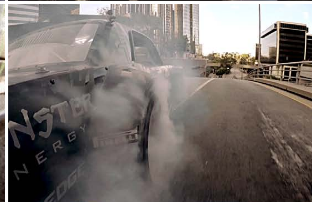
The surrounding 8 images are video frames, all shot on GoPro HERO4