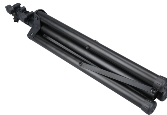
Folding Tripod Base