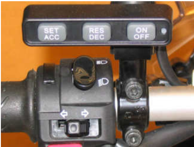
The Control Switch (5) is mounted to the left hand mirror stalk.

The Wiring Harness (6) has the same type of plugs or terminals that are already used on the motorcycle. Power for the cruise control and brake sensing is taken off the brake light switches by unplugging the rear brake light switch. Matching connectors on the cruise control loom are plugged in to the switch and the bike's harness. Speed sensing is sourced from the bike's speedometer speed sender. Tach (engine speed) sensing is detected from the bike's primary ignition circuit. This is used to disengage the cruise if the clutch is operated. The bike's clutch switch is also connected to the cruise control to disengage the cruise control. The cruise control is grounded on the battery negative terminal.