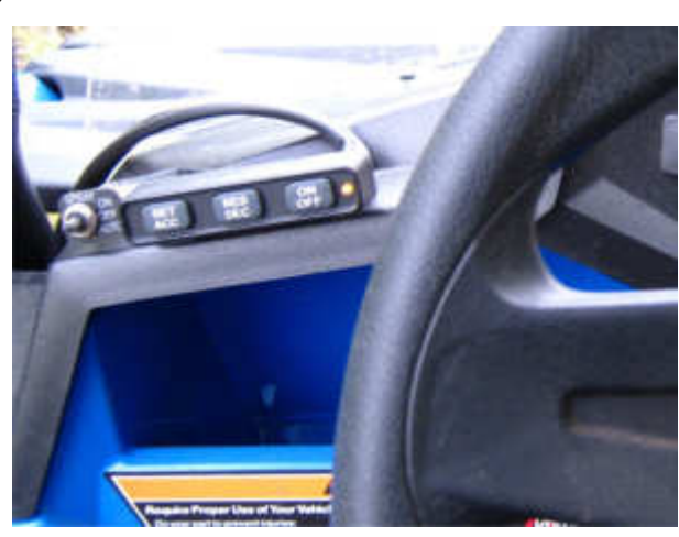
The Control Switch (2) can also be mounted on top of the dashboard on the right of the steering wheel. The photo below left shows the control switch on the Ranger XP without the optional spray power control switch. The photo below right shows the control switch fitted to another Polaris model WITH the optional spray power control switch.