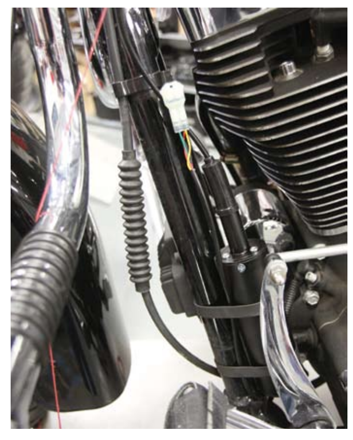
1 Craig begins by fitting the electric throttle servo to the left side front down tube using the two covered hose clamps supplied in the kit. The servo cable which can be seen at the top he then routes through the frame to the bike's throttle body and connects it to the existing cable bracket and then adjusts the cable free play to the supplied specifications.

The home page of their web site states: "Our cruise control works exactly the same as a car except that we designed and built it specifically for motorcycles.