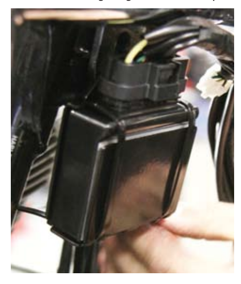
7 He now fits it to the front of the frame. Normally it would be mounted up the other way with the wires emerging from the bottom, rather than the top. However, on Jane's bike an aftermarket crash bar required us to (temporarily) mount it upside down. Not that this is a problem, as the electronics are enclosed in a plastic box that is filled with a rubberised compound to completely enclose the parts in a waterproof environment. The connectors are also of a totally waterproof design.