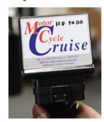
6 Craig holding the cruise control computer