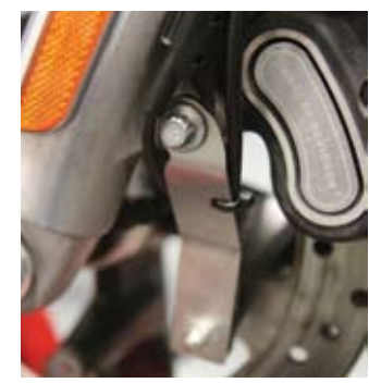
3 He now positions the speed sensor bracket using the caliper bolt.