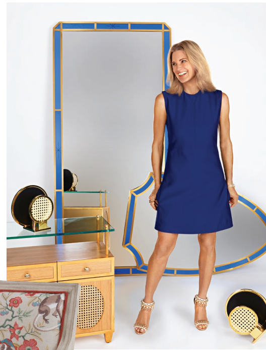
SHERWIN-WILLIAMS "Frank Blue" SW 6967