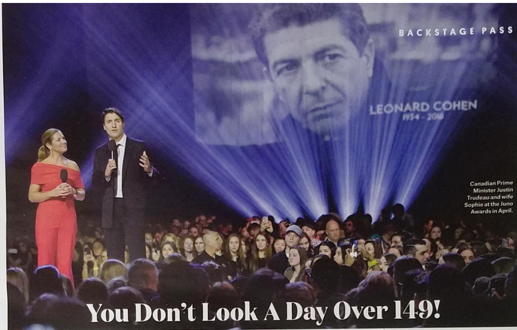
Canadian Prime Minister Justin Trudeau and wife Sophie at the Juno Awards in April.