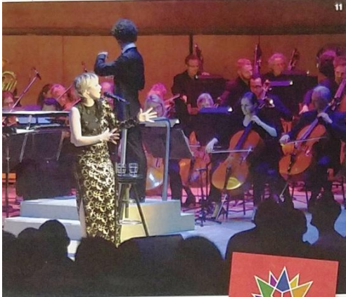
11 Jepsen performed with the Toronto Symphony Orchestra on June 17. 12 The album cover to Canada 150: A Celebration of Music .