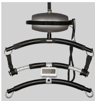
System mounted on the Luna ceiling hoist.

Sling attachment: a minimum of downward pressure locks the sling hook; pull upwards to unlock sling hook.