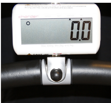
Easy to use and read. Big display.