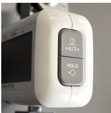
On/Off/Zero/Tare and Hold buttons