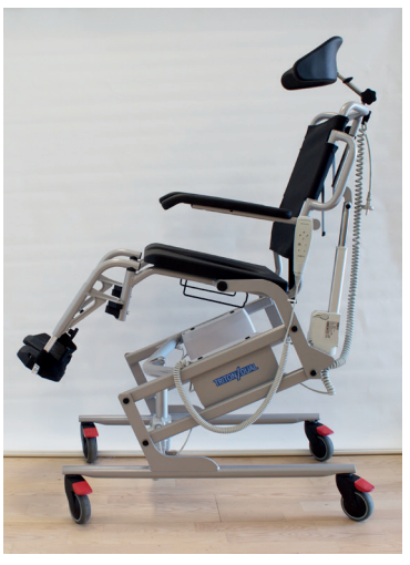
Triton/Dual with electric lifting function and tilt (backwards -30 / forward +7 degrees)