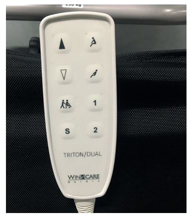
New hand control with more functions, for example two programmable memory buttons and one for safe transportation