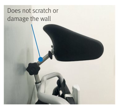
Multi adjustable head rest