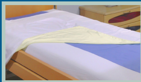
Swift® Slider Standard Length