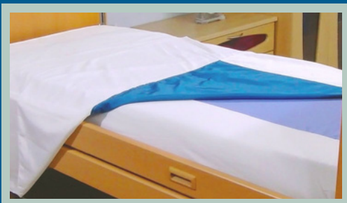
Swift® Slider Long Length