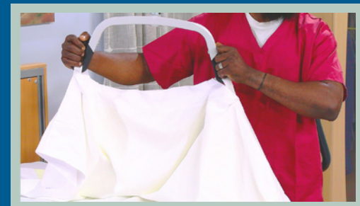
Swift® Slider with Handles