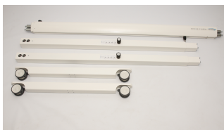
Easy to assemble and disassemble for transport