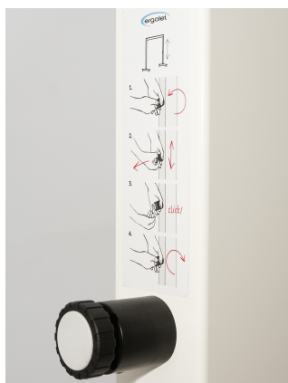
Easy height adjustment (gas spring mechanism). A simple user manual placed above the handle.