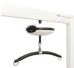
Luna ceiling hoist mounted on the Mobile Flex