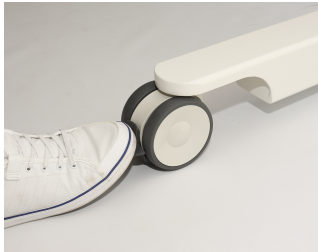
Two sets of wheels with brakes. Simply step on the pedal to activate the brake.