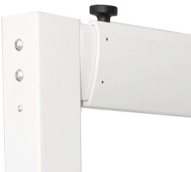
Easy to adjust width without using tools