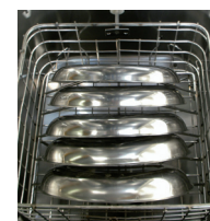
5 kidney trays holder