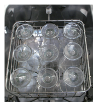
Basket for graduated glasses