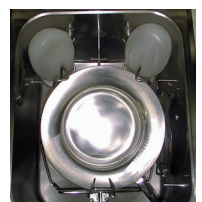
German stainless steel bedpan