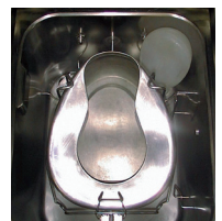
American stainless steel bedpan