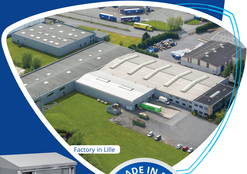
Factory in Lille