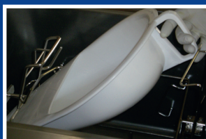
Loading of the bedpan with the handle Easy load, no risk of overflow