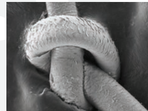
Hair068 2016/01/26 16:42 L UD6.0 x500 200µm 1/26/16-Uberliss6