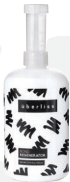
BOND REGENERATOR 17.75 fl oz

ÜBER STRENGTH FOR YOUR CLIENT'S HAIR, EACH & EVERY TIME! THE NEXT GENERATION OF BOND POWER IS HERE.