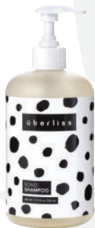
BOND SHAMPOO 17.75 fl oz