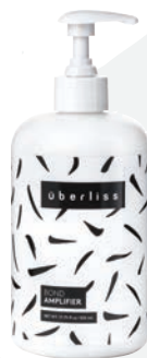
BOND AMPLIFIER 17.75 fl oz