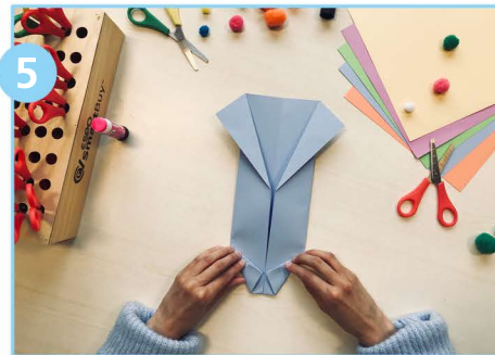
5 Flip the card over again and fold the bottom corners to the centre around 3cm up to form the collar.