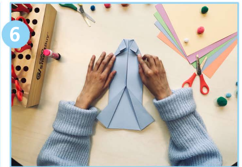
6 Rotate the entire card 180 degrees.