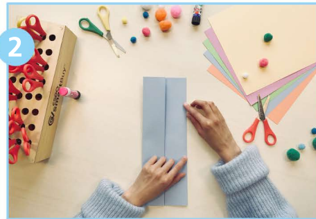
2 Fold the left side to the centre where you made a crease. Repeat this step with the right side.