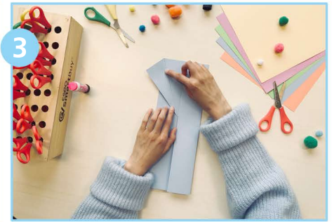
3 Take the inner left corner of the card and fold it back. Repeat this step with the right side.