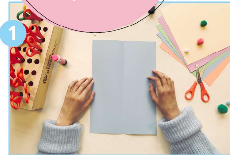
1 Fold your A4 piece of card in half, make a crease and open it out.