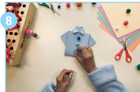
8 Decorate your shirt however you like, maybe try a tie or buttons.