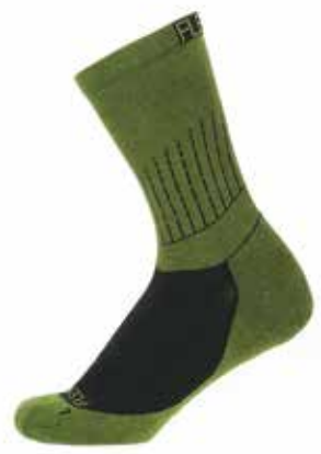
ArchFlex Crew Socks - Sizes - L (9-12 US) - Colours: Black, Chalk, Safari - 1 PAIR RRP - $12.00 - 3 PACK - $28.00