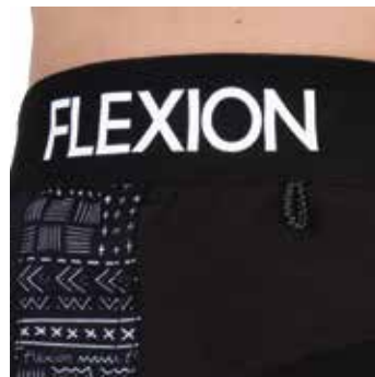
FlexProof - Black - Sizes - XS, S, M, L, XL, XXL - RRP - $60.00 - SKU: FPSB