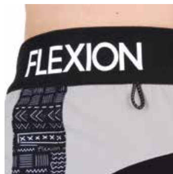
FlexProof - Light Grey - Sizes - XS, S, M, L, XL, XXL - RRP - $60.00 - SKU: FPSLG