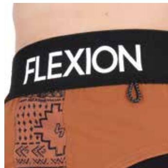
FlexProof - Desert Sand - Sizes - XS, S, M, L, XL, XXL - RRP - $60.00 - SKU: FPSDS