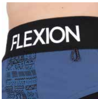
FlexProof - Ocean - Sizes - XS, S, M, L, XL, XXL - RRP - $60.00 - SKU: FPSOC