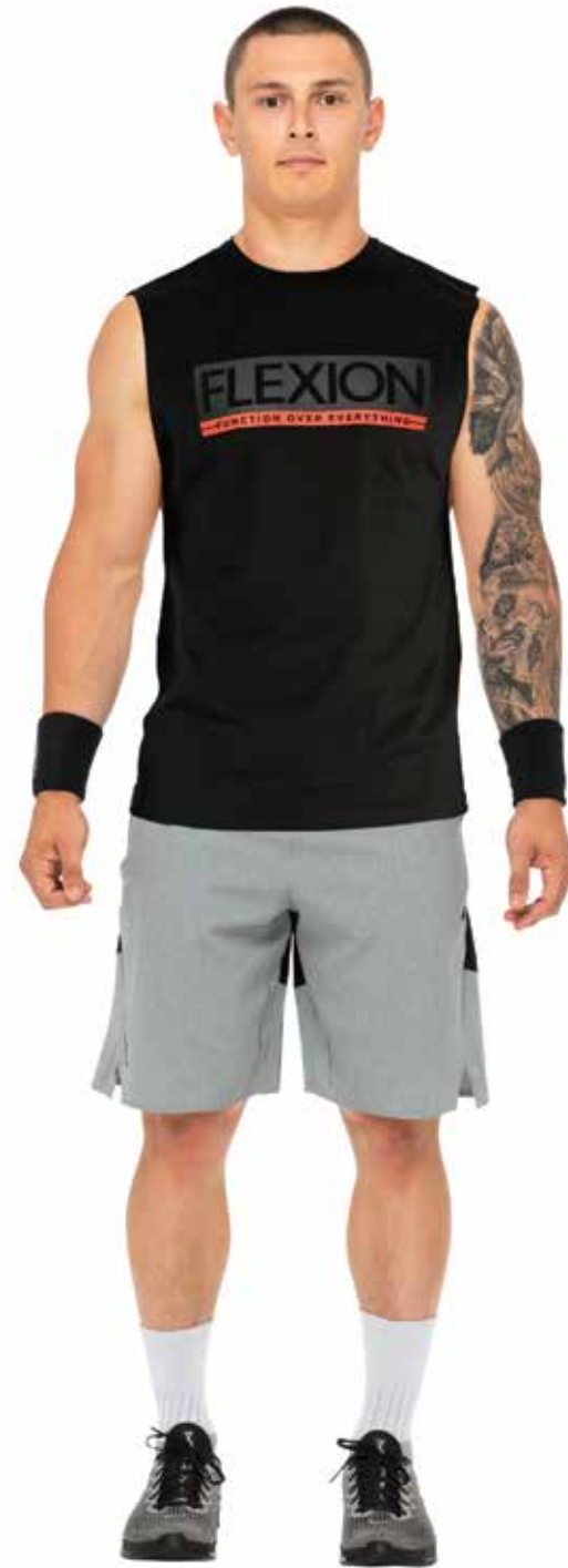
Flexion Headline Tank - Black - Sizes - S, M, L, XL - RRP - $28.00