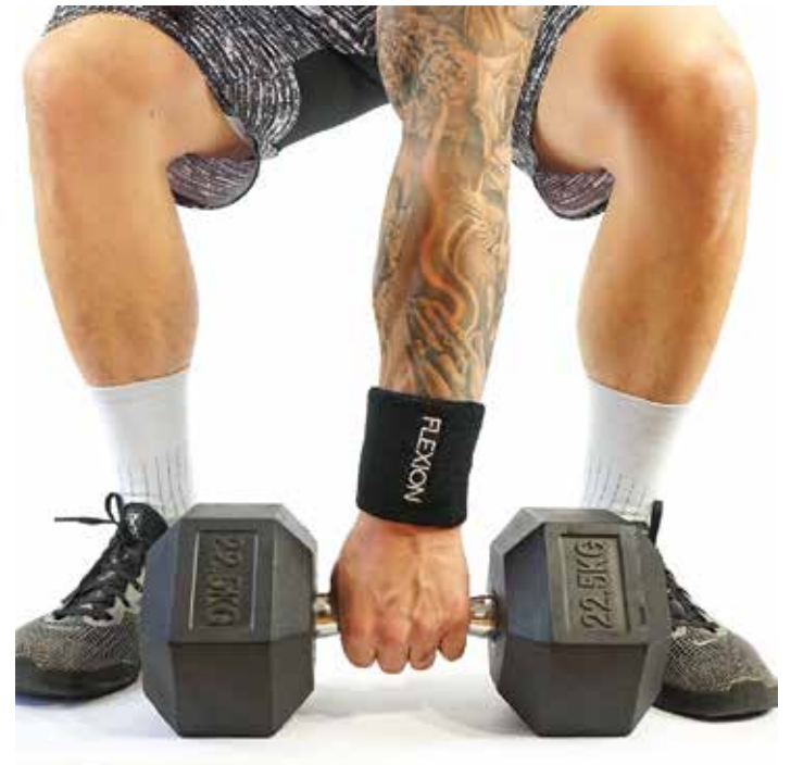
Wrist Sweatbands - Black - Sizes - OSFA - 1 PAIR RRP - $8.00 2 PACK - $12.00