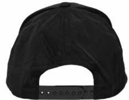
Flexion Lazer Cap - Sizes - OSFA - RRP - $28.00