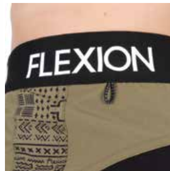
FlexProof - Olive - Sizes - XS, S, M, L, XL, XXL - RRP - $60.00 - SKU: FPSO