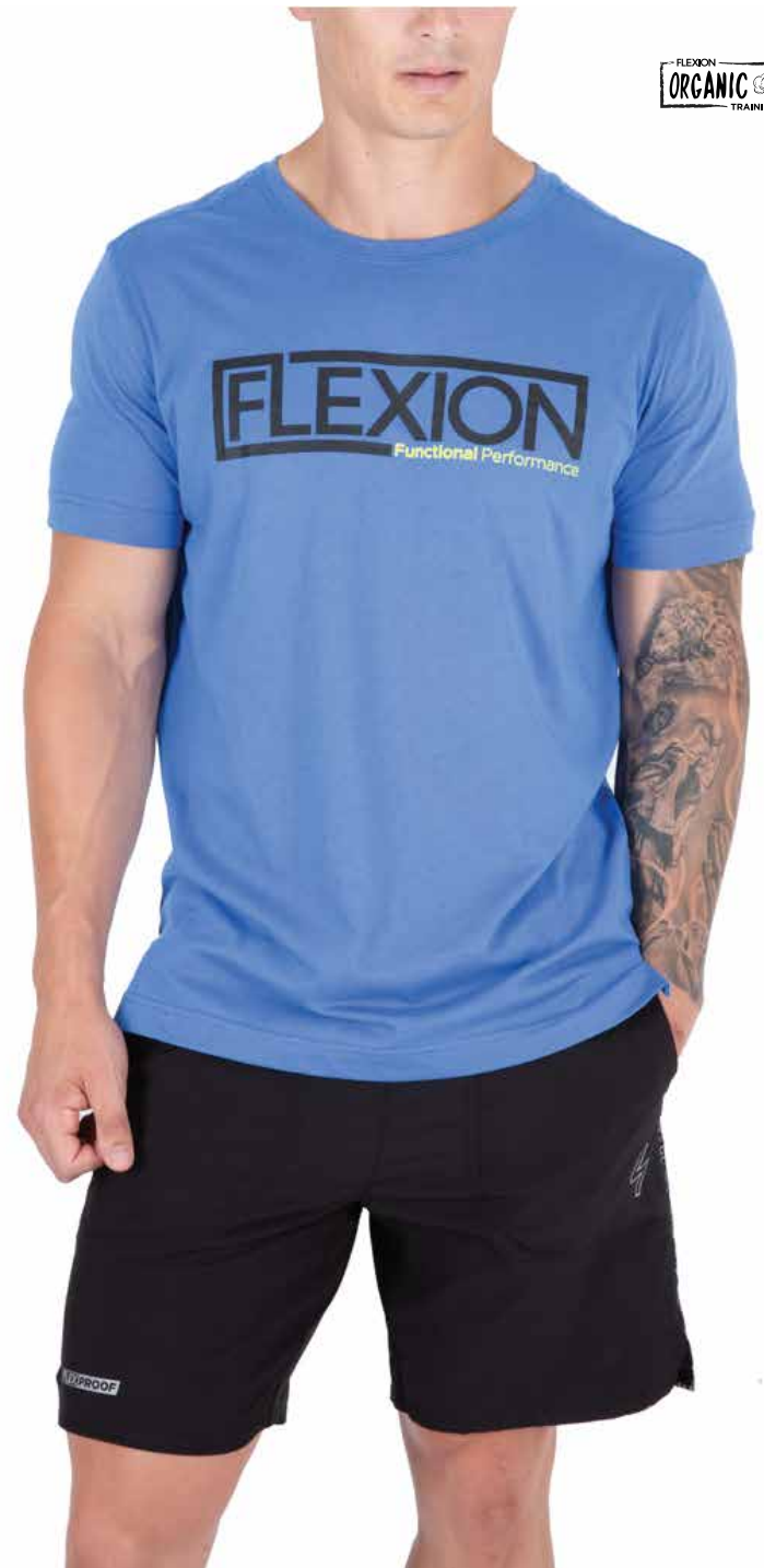
Organic Cotton Training Tee - Fern Green & Lagoon Blue - Sizes - XS, S, M, L, XL, XXL - RRP - $30.00