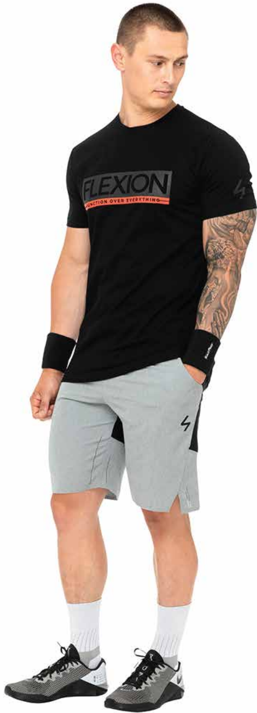
Flexion Headline T - Black - Sizes - S, M, L, XL - RRP - $28.00