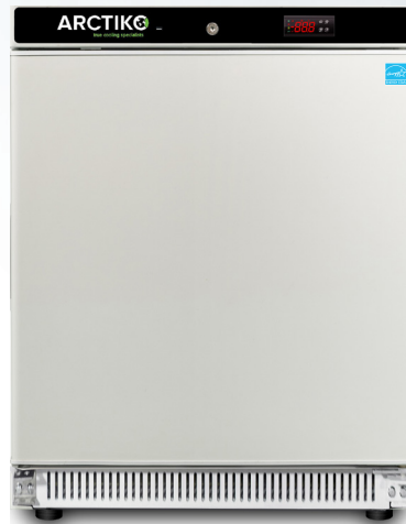
LFE 60-US ▲

Utilizes refrigerants that are fully compliant with the Environmental Protection Agency (EPA) and the Significant New Alternatives Policy (SNAP) regulations, ensuring environmentally responsible operation without compromising performance or safety.