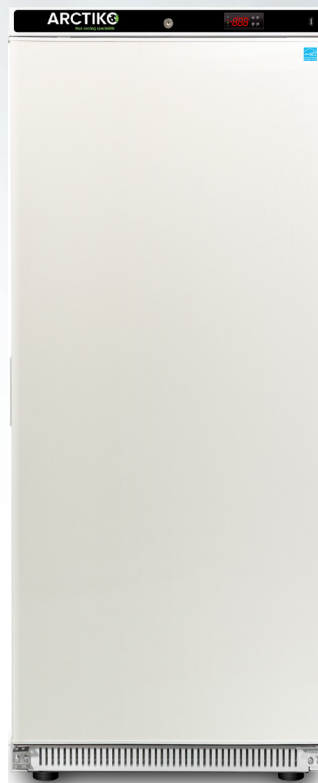
LFE 285-US ▲