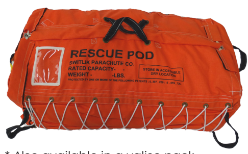
* Also available in a valise pack POD-8001-6.