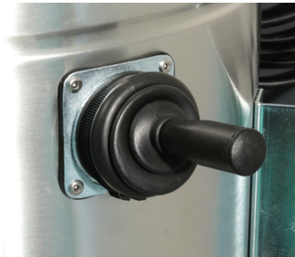
Side Mounted Manual Filter Shaker