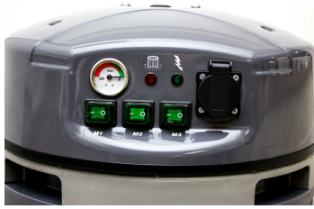
Independent Control for each motor. Pressure Gage and Filter Blockage Indicator