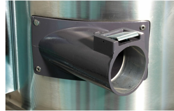
Tangential Suction Inlet, 70mm, Aluminum