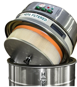
HEPA Filter Cartridge - Optional