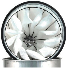
Star Shaped Polyester Main Filter