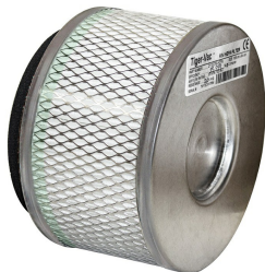
HEPA Filter - Included