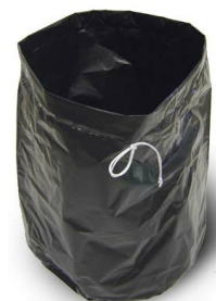
Conductive Polyliner Recovery Bag - Optional