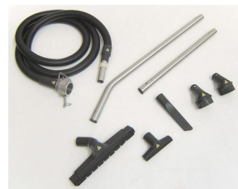
Ø1.25" (Ø32mm) ESD safe tools and accessories (Kit #2) - Optional