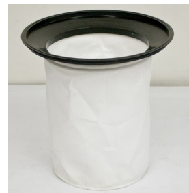
Main Cloth Filter - Included