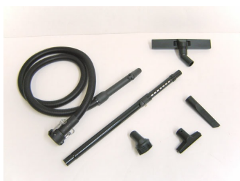
Ø1.25" (Ø32mm) Standard Tools and Accessories (Kit #1) - Optional