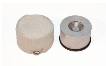
HEPA Filter with Safety Filter - Included