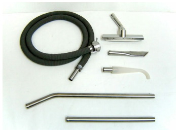
Ø1.25" (Ø32mm) Autoclavable tools and accessories (Kit #3) - Optional