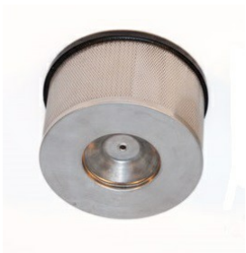
Upstream HEPA Filter - Included