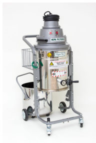
C-35L EX DT (MFS) with Recovery Tank removed