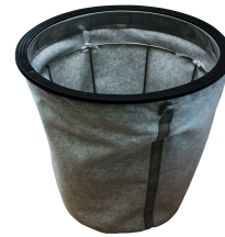
Main Cloth Filter and Cage, Static Dissipative - Included