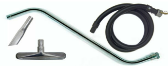
Ø1.5" (Ø38mm) Static Dissipative Tools and Accessories - Included