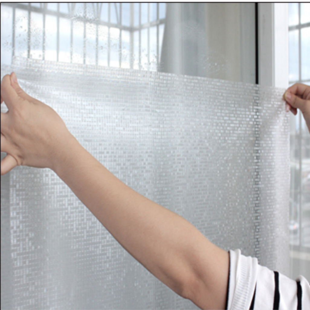
4. Peel off the clear backing of the film. Please spray a lot of water on the back side of the film when peeling off.