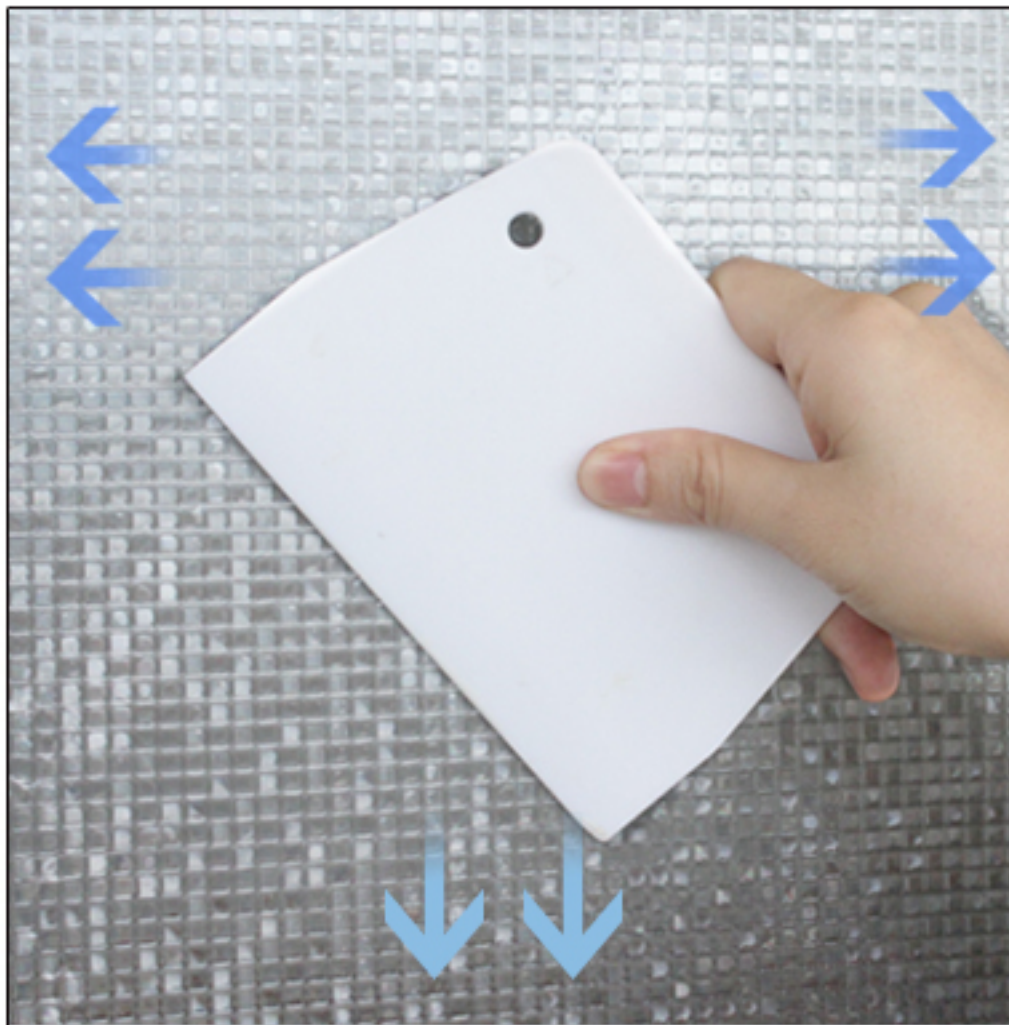
5. Use squeegee to push the bubbles out, from center to edges.