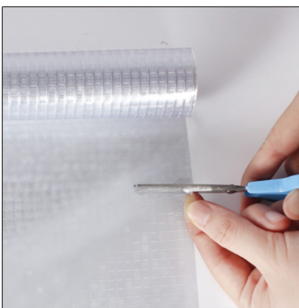
2. Cut the film so they measure about 2-3cm larger than the window panes being covered.