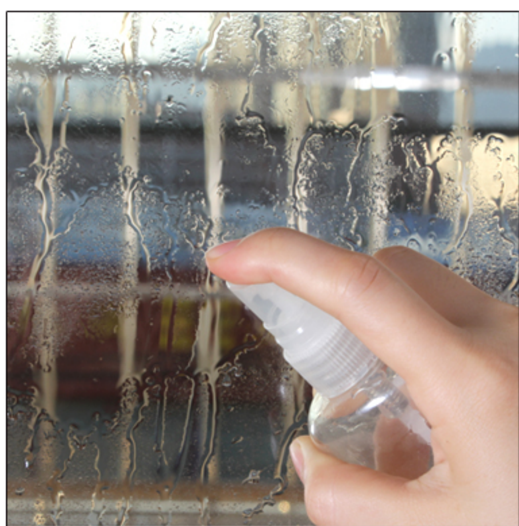
3. Generously spray enough water mix with a little bit dish washing liquid onto the window surface.