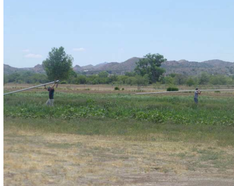
Above: Setting up irrigation can be a moving experience.