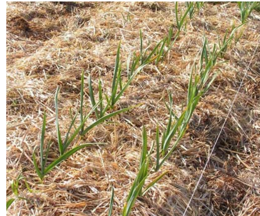
Purple Queen garlic. I got the stock from Native Seeds/SEARCH. Photo taken in April. Brad VanDyke, Spring City, UT