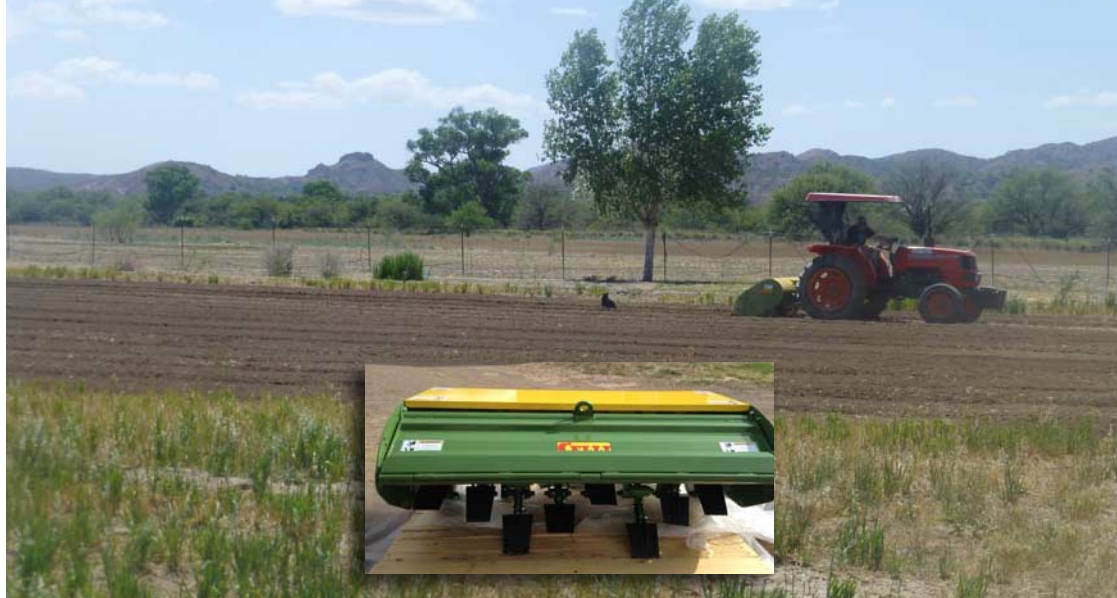
Left: Seeds are handsifted to remove chaff. Above: A chicken closely follows the progress of the tractor with the new spader attachment (inset) installed.