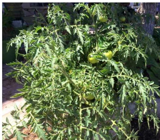
Flamenco Tomato, planted seeds indoors in January, planted out in March. Already bearing many green fruit. It won't be long until we are enjoying fresh ripe tomatoes. Andy Ward, Bisbee, AZ