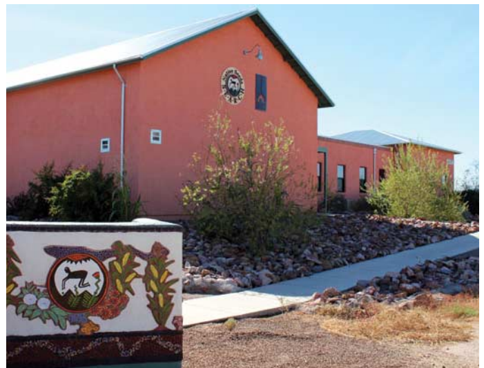
The NS/S Conservation Center.