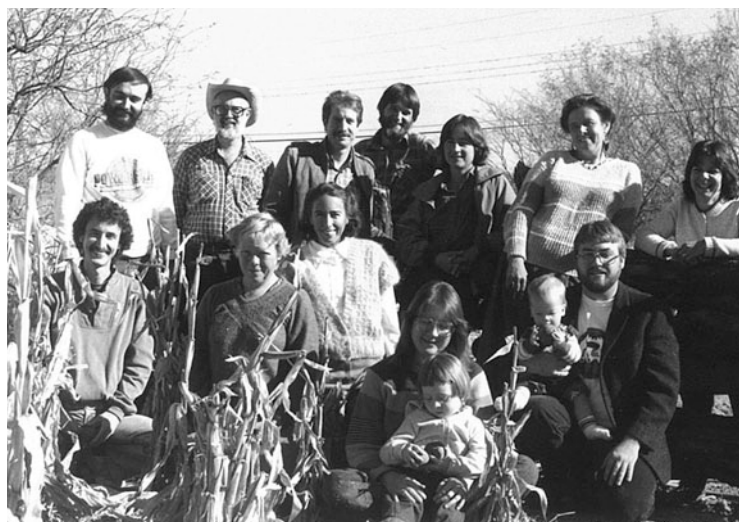
Once upon a time... the Native Seeds/SEARCH crew in the late 1980s.