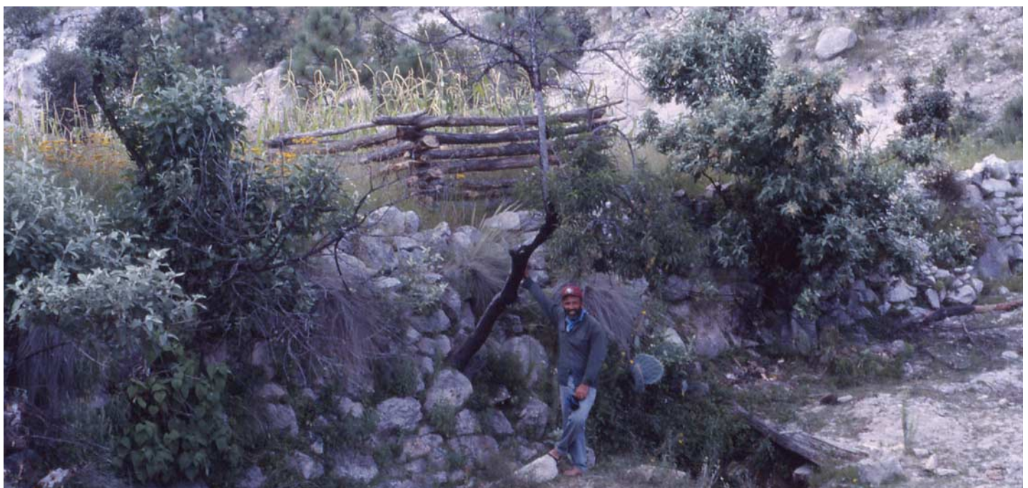
Juan Daniel Villalobos stands beneath an old trinchera supporting lush growth and soil stabilization near Sitagochi, Chihuahua.