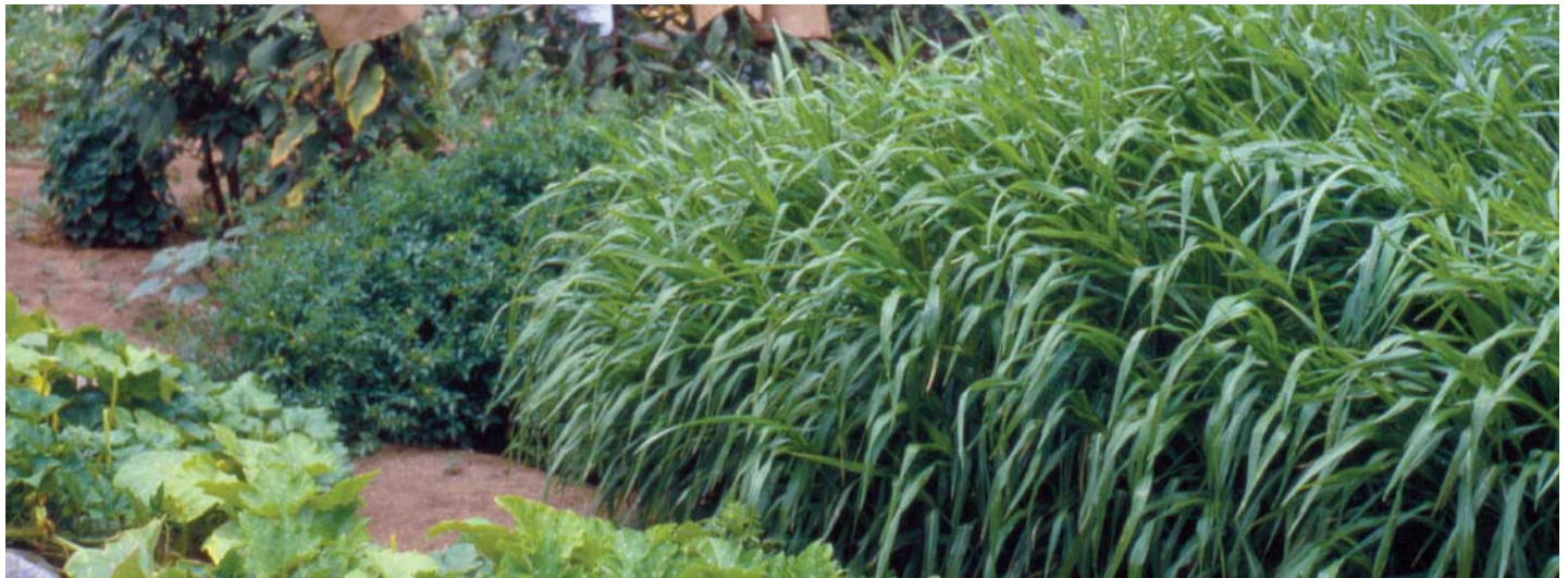
Sonoran panic grass growing in an early NS/S garden at Tucson Botanical Gardens.

The three of us were speechless at such a profound but simple question. None of us ever really gave the boy an answer. Over the last 15 years that question has haunted me. I still muse about it, trying to fashion some sort of response, usually when sitting around campfires in the backwoods of Sonora or Chihuahua. I am still not sure what answer any of the three of us might give, even after earning our PhDs at the University of Arizona.