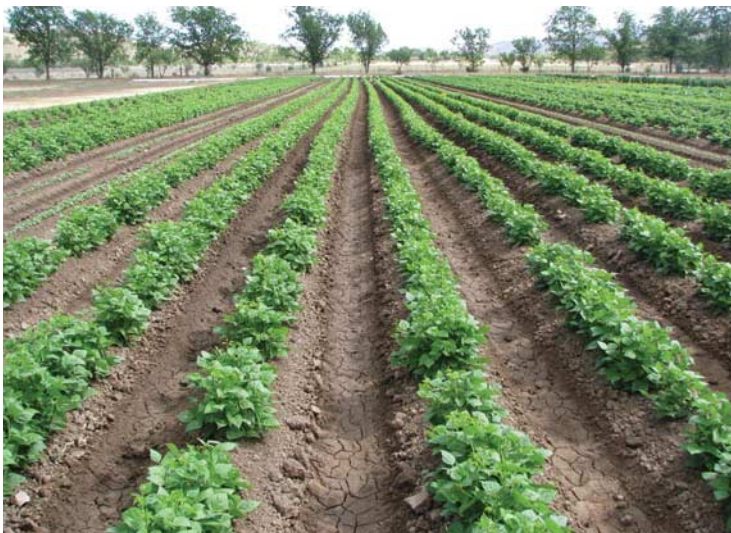
The Conservation Farm, verdant with beans in 2010.

need for a larger and improved seed bank and approved a capital campaign to raise funds for a new Seed Bank. The result is our brand new Agricultural Conservation Center on land leased from Pima County in Brandi Fenton Memorial Park and Binghampton National Historic Landscape. The Center was built with the generous support of many individuals and agencies, all believing in the mission of NS/S. The Agricultural Conservation Center provides the space required for NS/S to process and store our current and future seed collections and grow outs. The new Seed Bank is much more secure than before and greatly reduces the risk of losing these unique, adapted, heirloom crop varieties from across our bi-national region. The shared heritage of these rare and endangered seed stocks, developed by so many different individuals and cultures over so many centuries, is safer now and more available to meet the growing needs of our modern world.