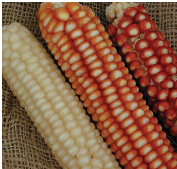
Gileño, a Tarahumara landrace maize variety collected by Barney Burns in Cerocahui, Chihuahua, in 1984. This is one of over two hundred maize accessions collected by Barney during the assembly of the Native Seeds/SEARCH collection.

The concentration of so many important seed stocks is due to three factors. First, many of the Tarahumara Indians persist in their traditional dry farming activities. Second, these Indians inhabit an area containing incredible diversity geographically and environmentally which has necessitated local adaptations in each of the types of seedstocks grown. Third, the extremely rugged and isolated Tarahumara region has allowed the survival of these locally adapted