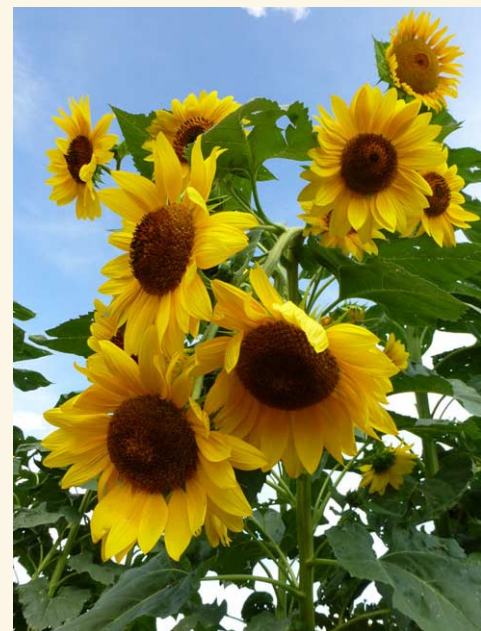
Radiant sunflowers abloom on the NS/S Conservation Farm in Patagonia, AZ.