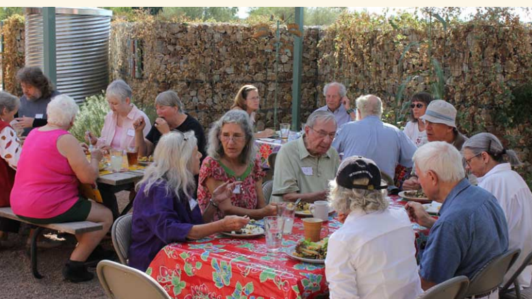
Below: Our fabulous volunteers enjoy a healthy brunch in the NS/S Conservation Center courtyard—our treat!