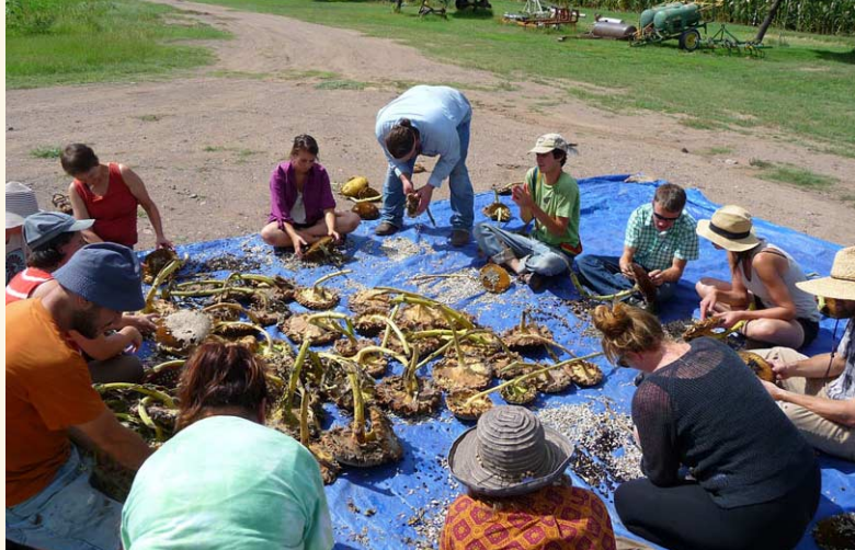
Seed Schoolers harvest and clean landrace sunflower seeds at the NS/S Conservation Farm.

Also in 2013, we broadened the definition of “our community” to include seed stewards working in other parts of the country. It began when a Grain School attendee from Montana was so impressed by the course that he begged, “What can we do to get you to teach a class here? We need you. No one else is doing this.” And so the “National” aspect of our program was born. For our inaugural event, we partnered with the University of Montana in Missoula in January of 2013. Despite the snow and cold, it was a smashing success. At nearly 40 students, it was also our largest class to date! We learned a tremendous amount about the value and synergy of collaboration with partners at other organizations, and we were even able to offer college credit for university students and obtain USDA funding to help underwrite the tuition costs.