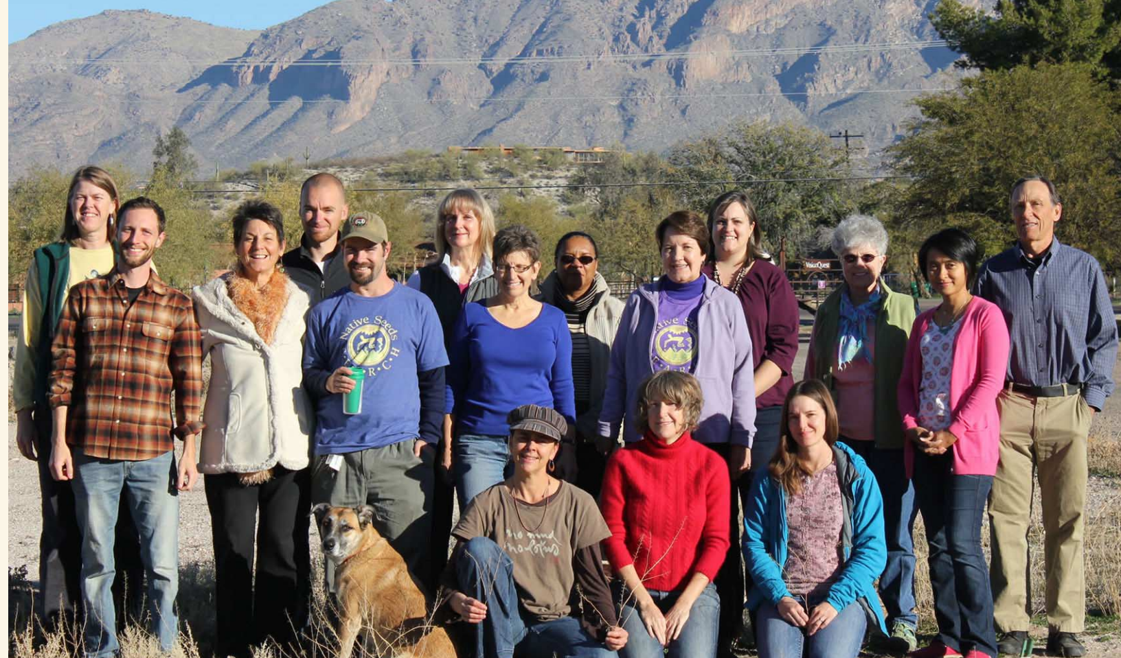
Say seeds! The NS/S staff bundles up for a photo against the Santa Catalina Mountains.