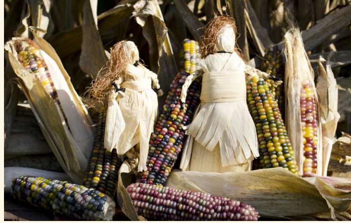
Above: Glass Gem: the world's most famous heirloom corn.

The wholesale program is also running strong with NS/S seeds now offered at Tucson and Phoenix area Whole Foods Markets and several plant nurseries throughout the region. Our Community Seed Grant and Native American Free Seed programs continue to grow and reach new people. Read more about the year's highlights of our Community Seed Grant program on pages 8-9.