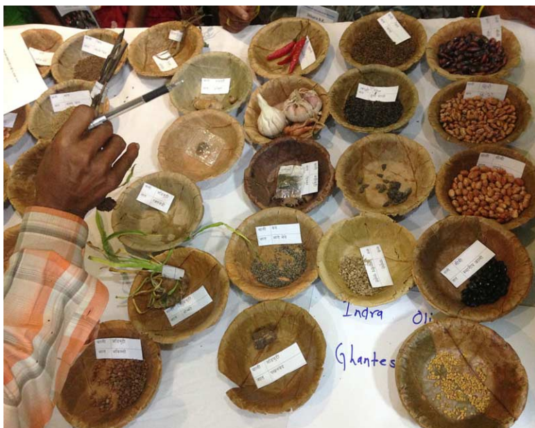
Custodian farmers exchange seeds during the workshop. Pictured here are seeds or bulbs of common beans, cowpeas, chile, garlic, taro, mustards, snake gourd, various millets, and several unidentified local species.

A longer version of this article with references can be found on our website ( nativeseeds.org ). If you are inspired by this work, please give generously in the enclosed envelope to support our efforts regionally, nationally and internationally!