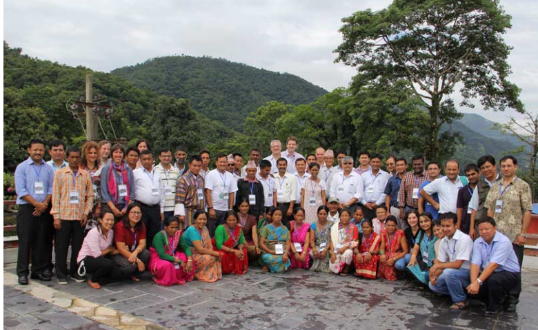
Participants of the custodian farmer workshop, including NGO staff, farmers, and key government collaborators.

The first workshop, entitled “Enhancing the contribution of custodian farmers to the National plant genetic resources system in Nepal,” brought together custodian farmers from throughout Nepal (plus a few from Bhutan and India) along with LI-BIRD staff, key people