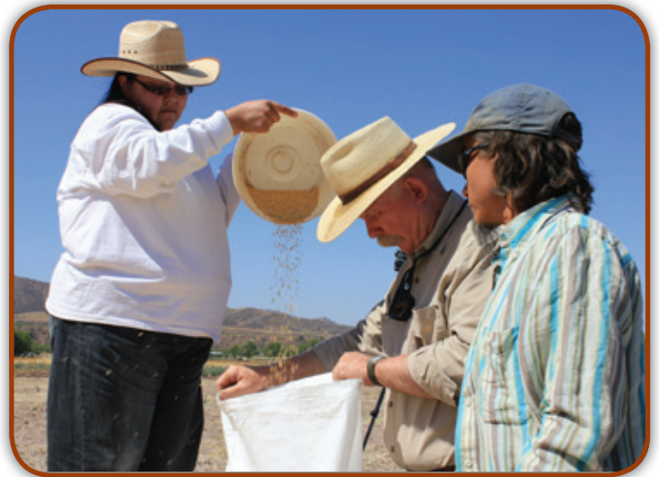
Seed School students winnowing White Sonora wheat.