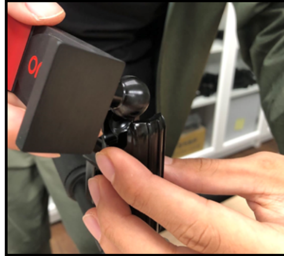
Step 6) Insert the center link bar onto the ring base collar and insert the smartphone top clamp.