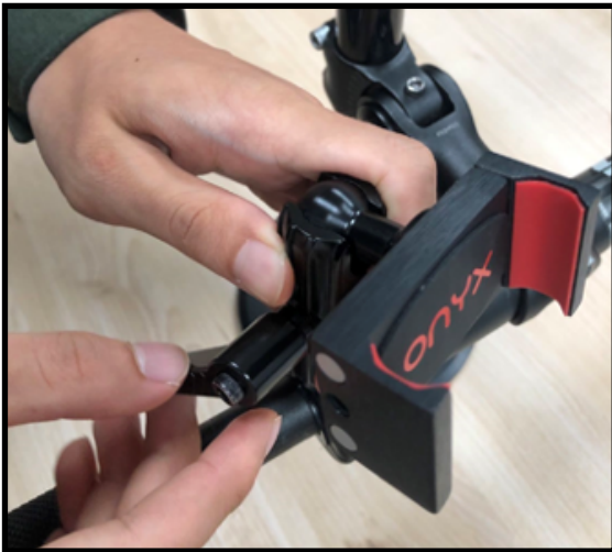
Step 7) Find the optimal position angles and tighten down the handle.