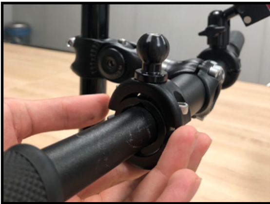
Step 3) Attach the ring base collar to the handlebar.