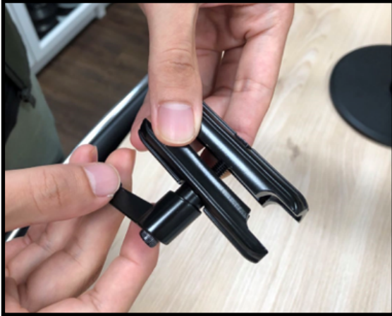
Step 5) Open the center link bar by loosening the handle.