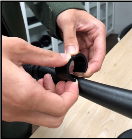
Step 1) Choose the correct size nylon spacer and attach it on the handle.