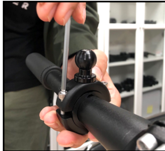
Step 4) With the nylon spacer inserted, tighten the 2 hex screws on the ring base collar.