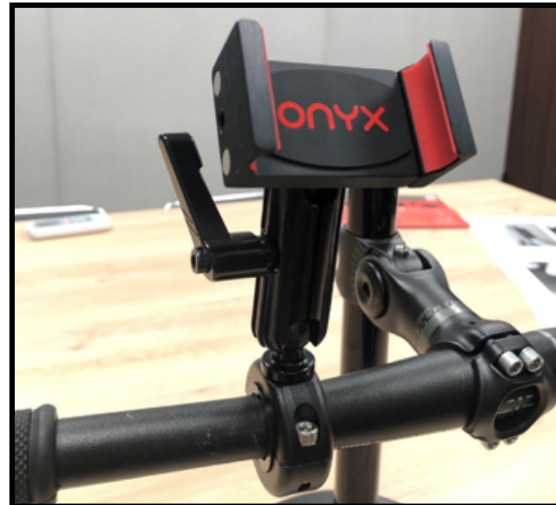
Step 8) All done, great job!