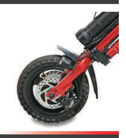
Dual disc brakes, dual lights and oversize 12.5" x 3" tire