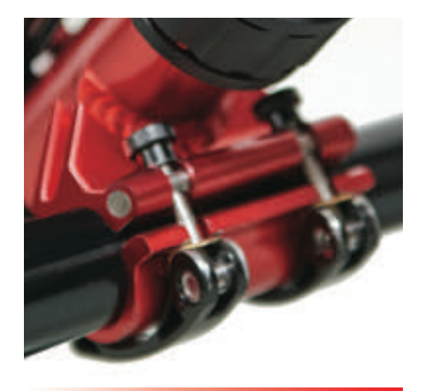
Frame easily comes apart via "Double quick release"