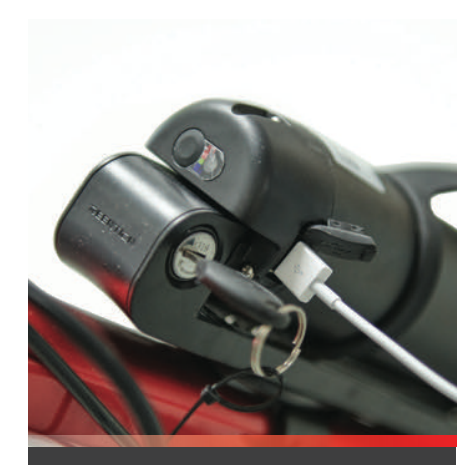
USB phone charger turns your battery into a power bank