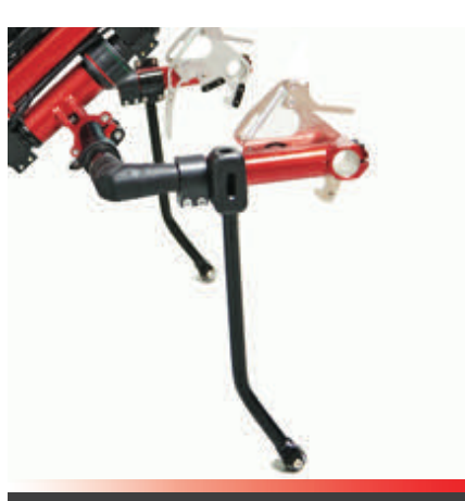
Dual kickstands for easy storage and simple transfers