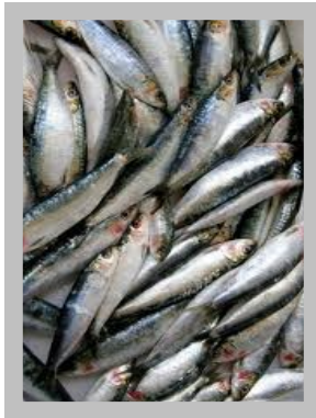
Direct Food Contact