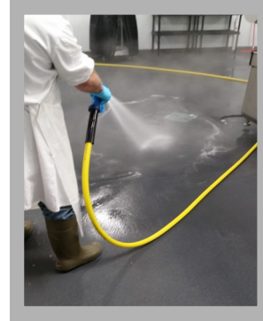
Floor and Drain Sanitation