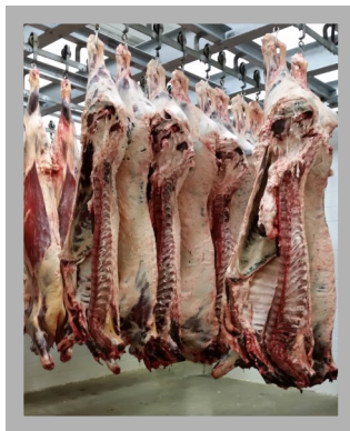
Direct Food Contact