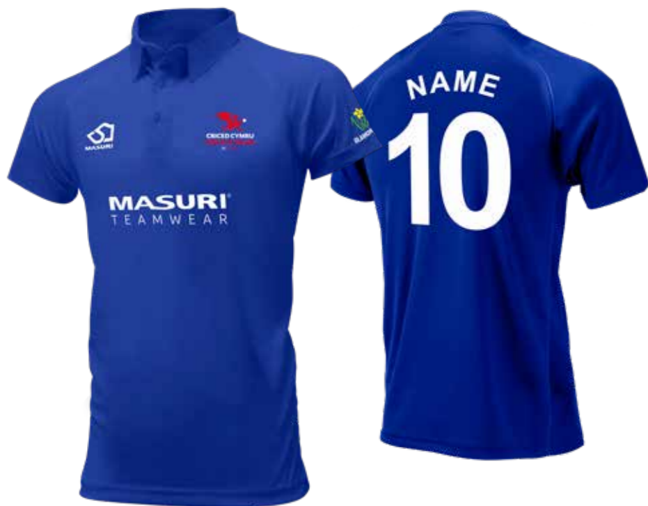
Cricket Wales playing shirts created from our core range of coloured garments.

Introducing our brand-new coloured playing kit range for the 2022 season. With more and more leagues switching to coloured kits, we have developed a solution for any white ball teamwear requirement. Building on the success and popularity of our whites, our offering now includes an extensive range of coloured playing shirts and trousers, providing a truly bespoke look for your team. All coloured playing items utilise our latest state-of-the-art logo printing technology, ensuring your players look and feel like the pros.