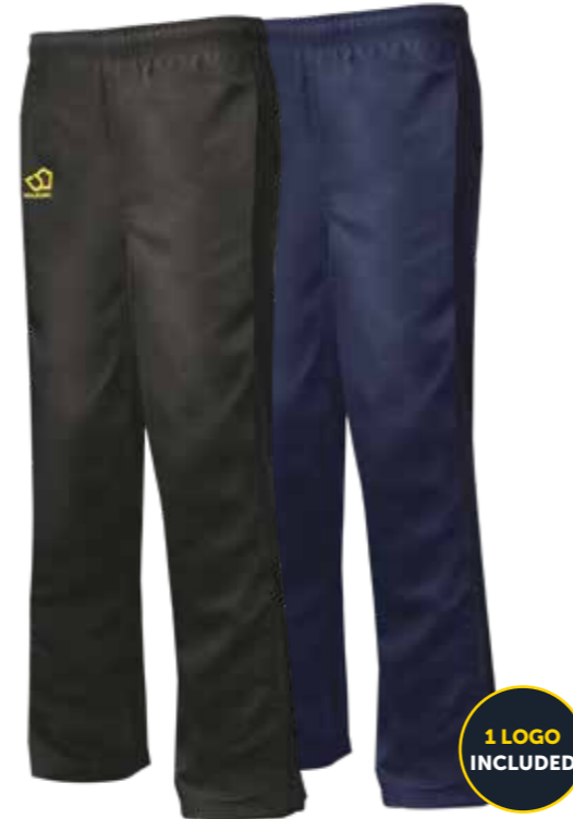
WOMENS TRACKSUIT BOTTOMS MCR0095 (JUNIOR MCR0063)

COMPOSITION: 100% Polyester Tech-fleece (250 gsm)