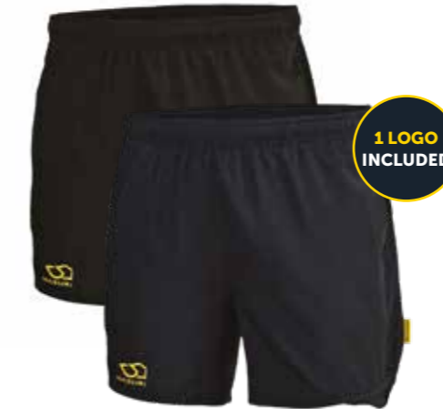
WOMENS SHORTS MCR0010 (JUNIOR MCR0010)

SENIOR: 6-18 JUNIOR: 7-8 years – 13-14 years