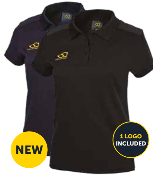
WOMENS PERFORMANCE POLO MCR0062

COMPOSITION: 65% Cotton, 35% Polyester Pique (200gsm)