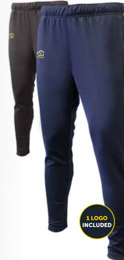
WOMENS SLIMFIT TROUSERS MCR0031 (MCR0031 JUNIOR)

COMPOSITION: Main Fabric (shell): 100% Polyester Ripstop (110gsm)