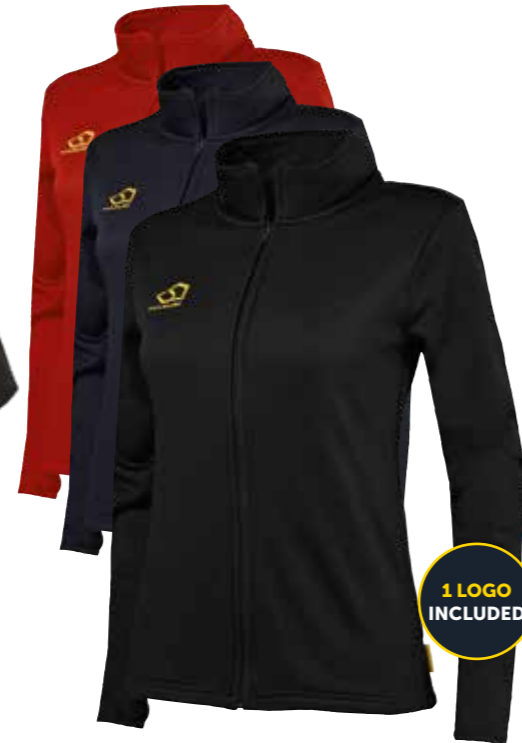
WOMENS FULL ZIP TECH FLEECE MCR0062

COMPOSITION: 100% polyester micro pique (175 gsm)