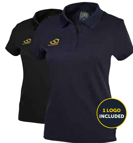
WOMENS POLO SHIRT MCR0060