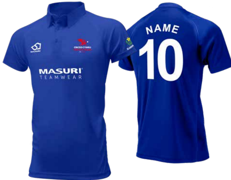
Cricket Wales playing shirts created from our core range of coloured garments.

Introducing our brand-new coloured playing kit range for the 2022 season. With more and more leagues switching to coloured kits, we have developed a solution for any white ball teamwear requirement. Building on the success and popularity of our whites, our offering now includes an extensive range of coloured playing shirts and trousers, providing a truly bespoke look for your team. All coloured playing items utilise our latest state-of-the-art logo printing technology, ensuring your players look and feel like the pros.