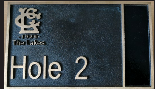
Bronze Plaque The Lakes Golf Club