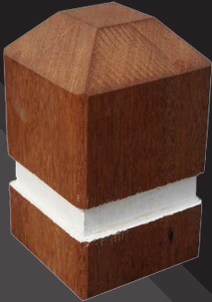
Timber Tee Marker Bonnie Doon Golf Club