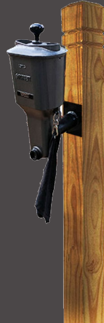
Ironbark Post With Ball Washer Strathfield Golf Club