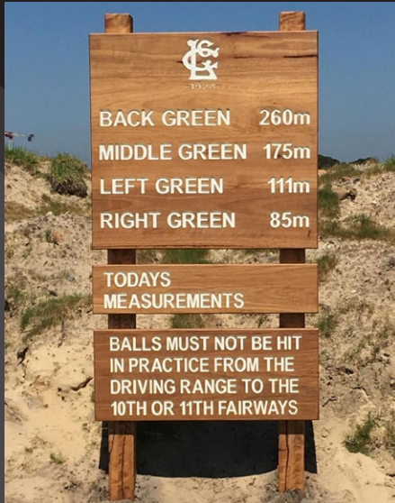
Blackbutt Information Sign The Lakes Golf Club