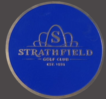
Powder Coated Bronze Permanent Marker Strathfield Golf Club