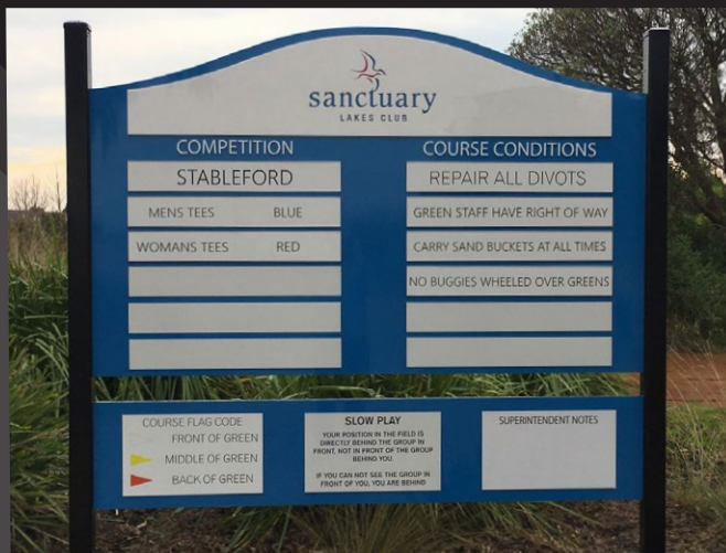
Local Rules Board Sanctuary Lakes Golf Club