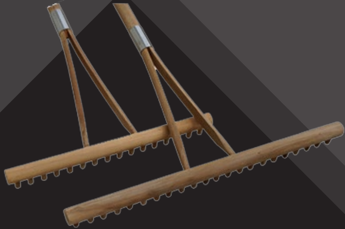
Teak Bunker Rakes 405mm & 550mm