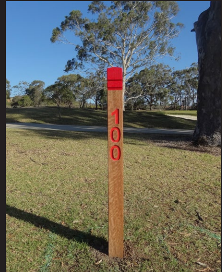
Ironbark Distance Post Strathfield Golf Club