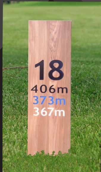
Teak Tee Sign Lake Karrinyup Country Club