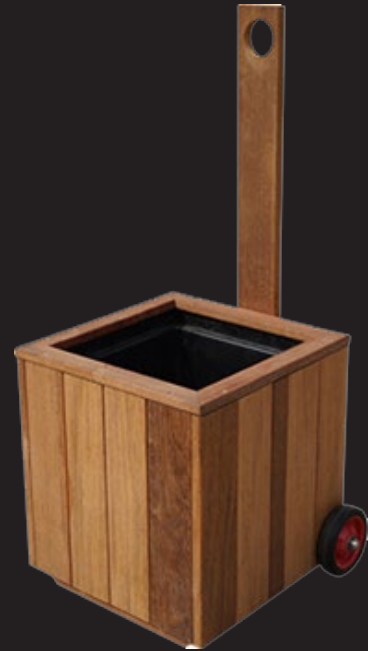
Timber Portable Divot Box