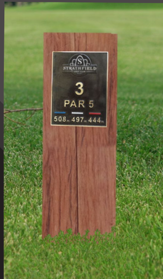
Ironbark Post With Bronze Plaque Strathfield Golf Club