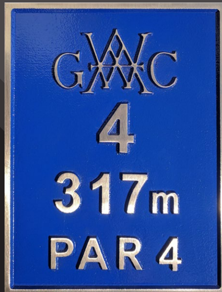
Powder Coated Bronze Plaque W.A.G.C