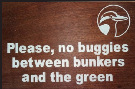
Merbau Sign Terrey Hills Country Club