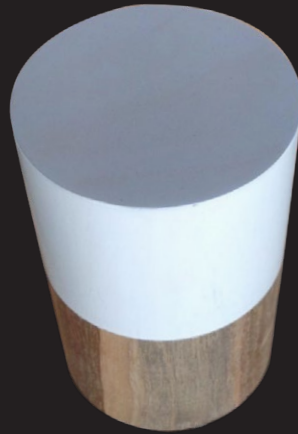
Teak Tee Marker