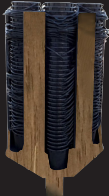
Ironbark Bucket Holder Strathfield Golf Club