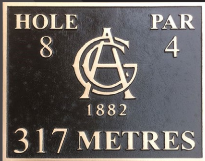
Bronze Plaque The Australian Golf Club