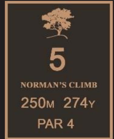
Bronze Plaque Cathedral Golf Club