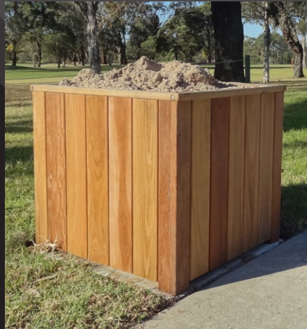
Ironbark Sand Bin Strathfield Golf Club