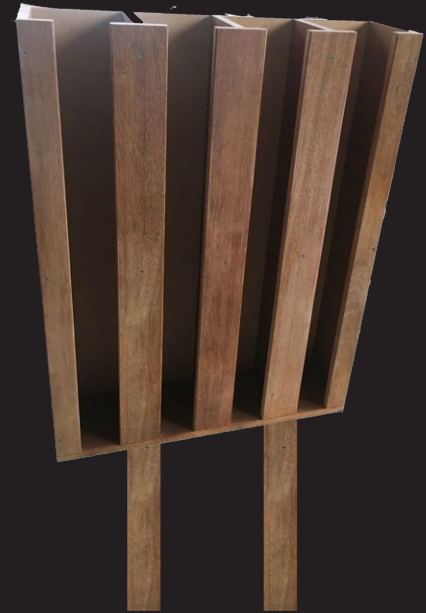
Blackbutt Bucket Holder