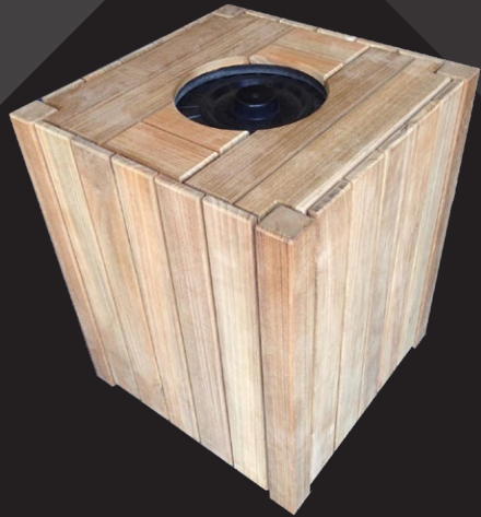
Teak Litter Bin Lake Karrinyup Country Club