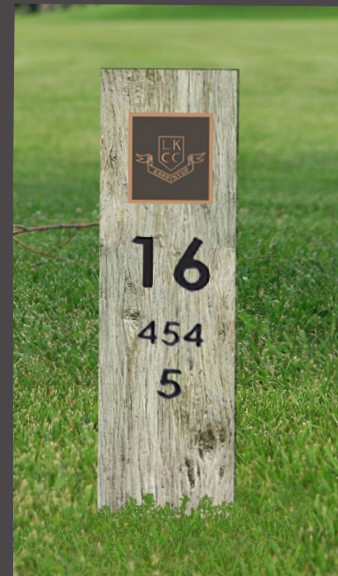
Teak Tee Sign Lake Karrinyup Country Club