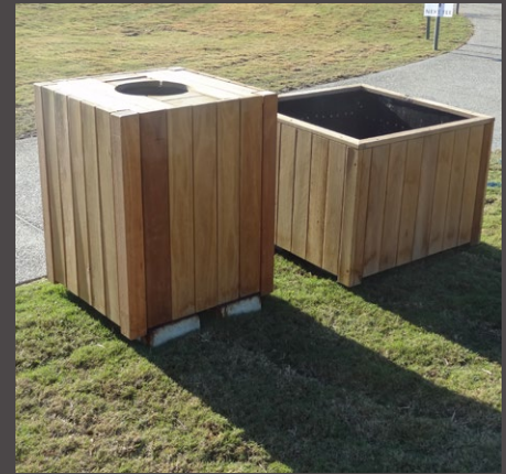
Ironbark Litter and Sand Bin Strathfield Golf Club