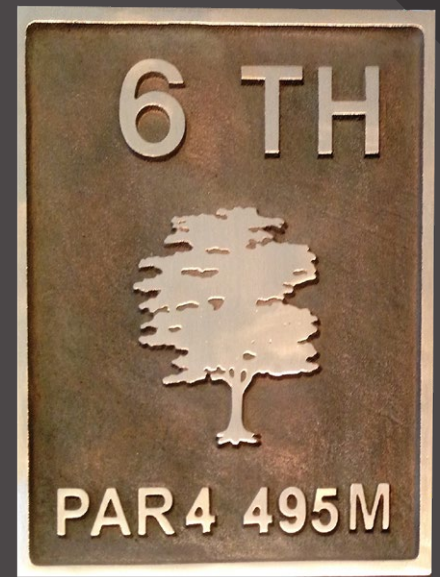
Bronze Plaque Elanora Country Club