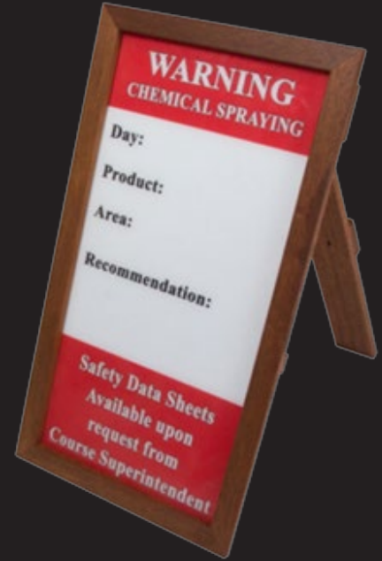
Merbau A Frame