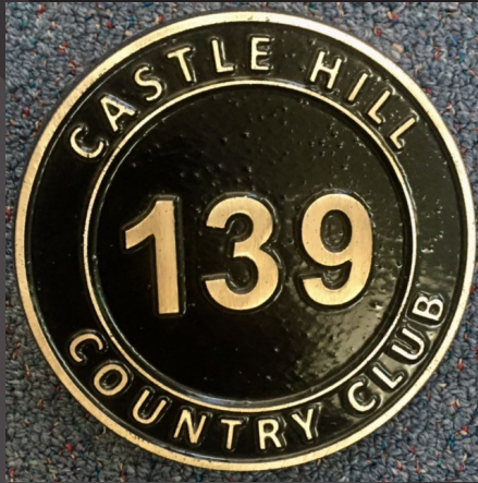
Bronze Distance Plate Castle Hill Country Club