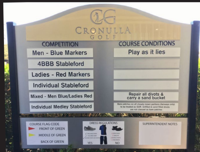
Local Rules Board Cronulla Golf Club