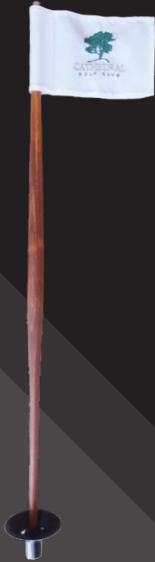
Tasmanian Oak PPG Stick Cathedral Golf Club