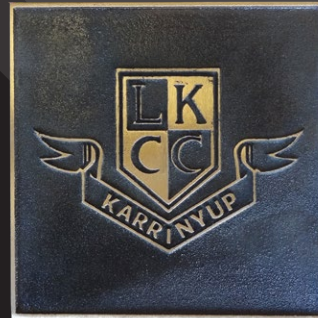
Bronze Plaque Lake Karrinyup Golf Club