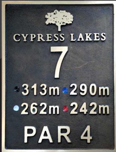
Bronze Plaque Cypress Lakes