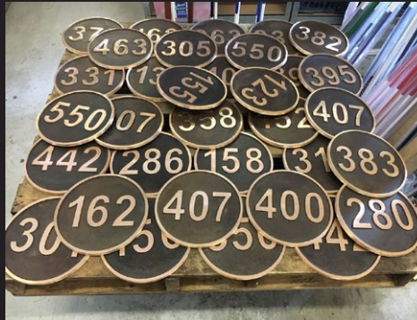
Bronze Distance Markers Moore Park Golf Club