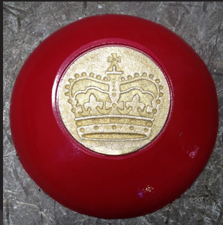
Aluminum Bronze Logo Tee Marker Elanora Country Club