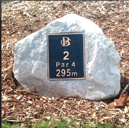
Bronze Plaque Bexley Golf Club