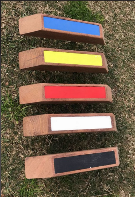
Merbau Timber Tee Markers