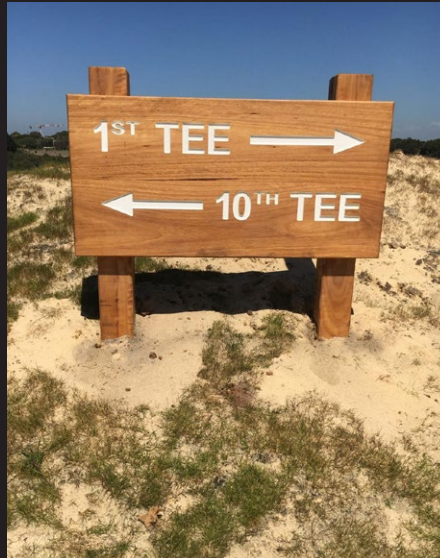
Blackbutt Information Sign The Lakes Golf Club