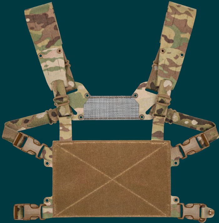
Chesty Rig Mini V2 (Front)