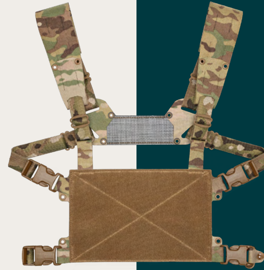
Chesty Rig Mini V2 (Front)