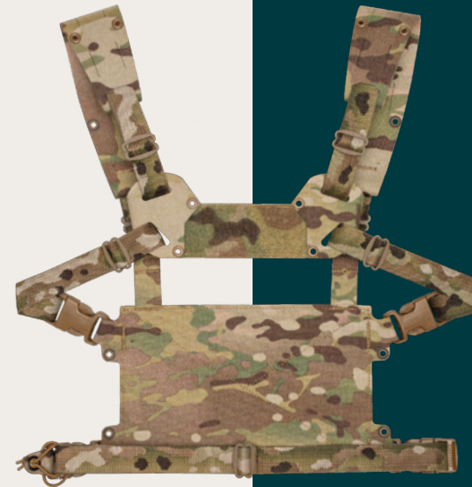
Chesty Rig Mini V2 (Back)