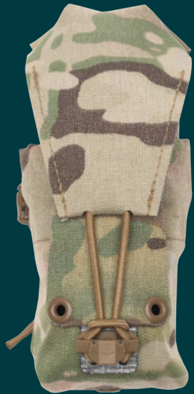
Banger Pocket (Front)