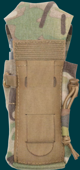
Banger Pocket (Back)