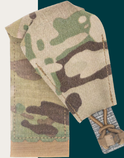
Retention Flap and Silent Tuck Tab