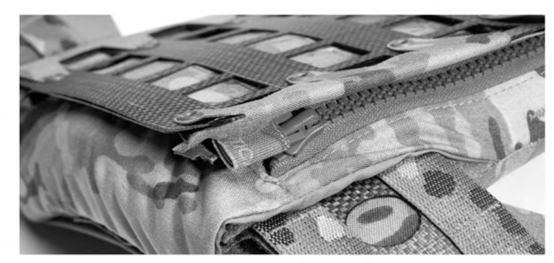
4.TUCK METAL ZIPPER PULL INTO ELASTIC RETENTION LOOP OF BACK PANEL. REAPEAT FOR OPPOSING SIDE.