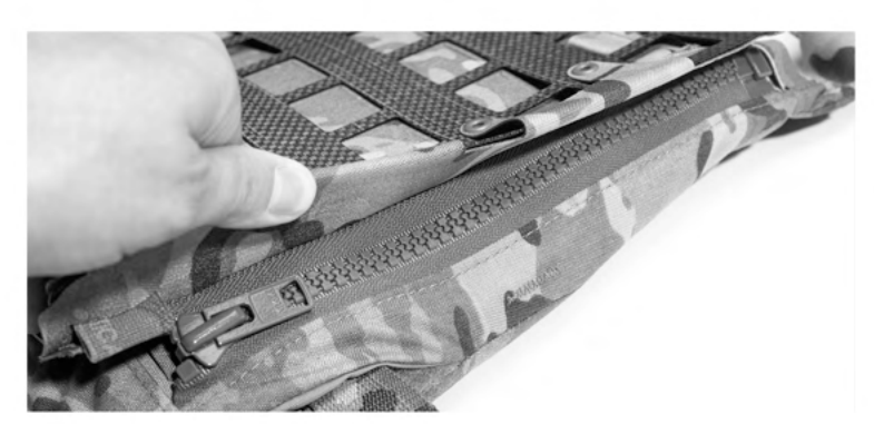
3. FASTEN SIDE ZIPPER OF BACK PANEL TO THE CARRIER SIDE ZIPPER. REPEAT FOR OPPOSING SIDE.