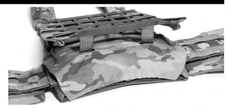
2. INSERT BOTTOM TUCK TABS OF BACK PANEL FULLY INTO THE BOTTOM MOLLE SLOTS OF CARRIER.