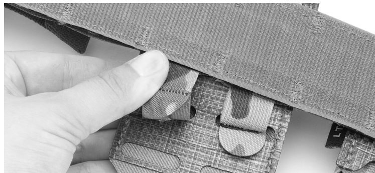
4. COMPLETE BY PUSHING THE PULL TAB INTO THE SECOND SLOT OF THE POUCH.