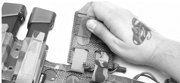
2. FIRMLY GRAB THE PULL TAB AND WEAVE IT THROUGH THE FIRST SLOT OF THE POUCH