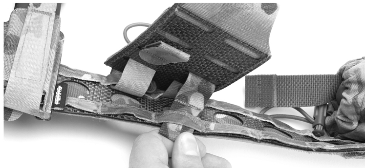
3. WEAVE THE PULL TAB THROUGH THE NEXT ROW OF MOLLE WEBBING