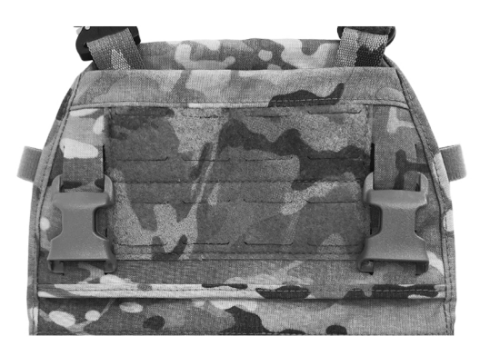
4. REPEAT STEPS 1-3 ON THE OPPOSING SIDE. ENJOY.