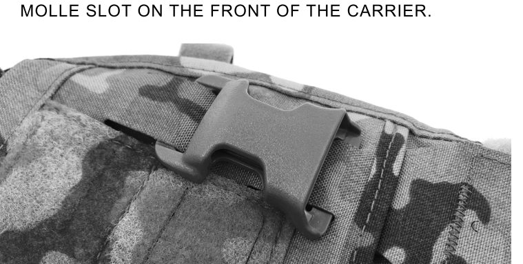
3. WHEN INSTALLED CORRECTLY, BUCKLE BARS SHOULD BE FULLY SEATED IN THE VERTICAL MOLLE SLOTS.